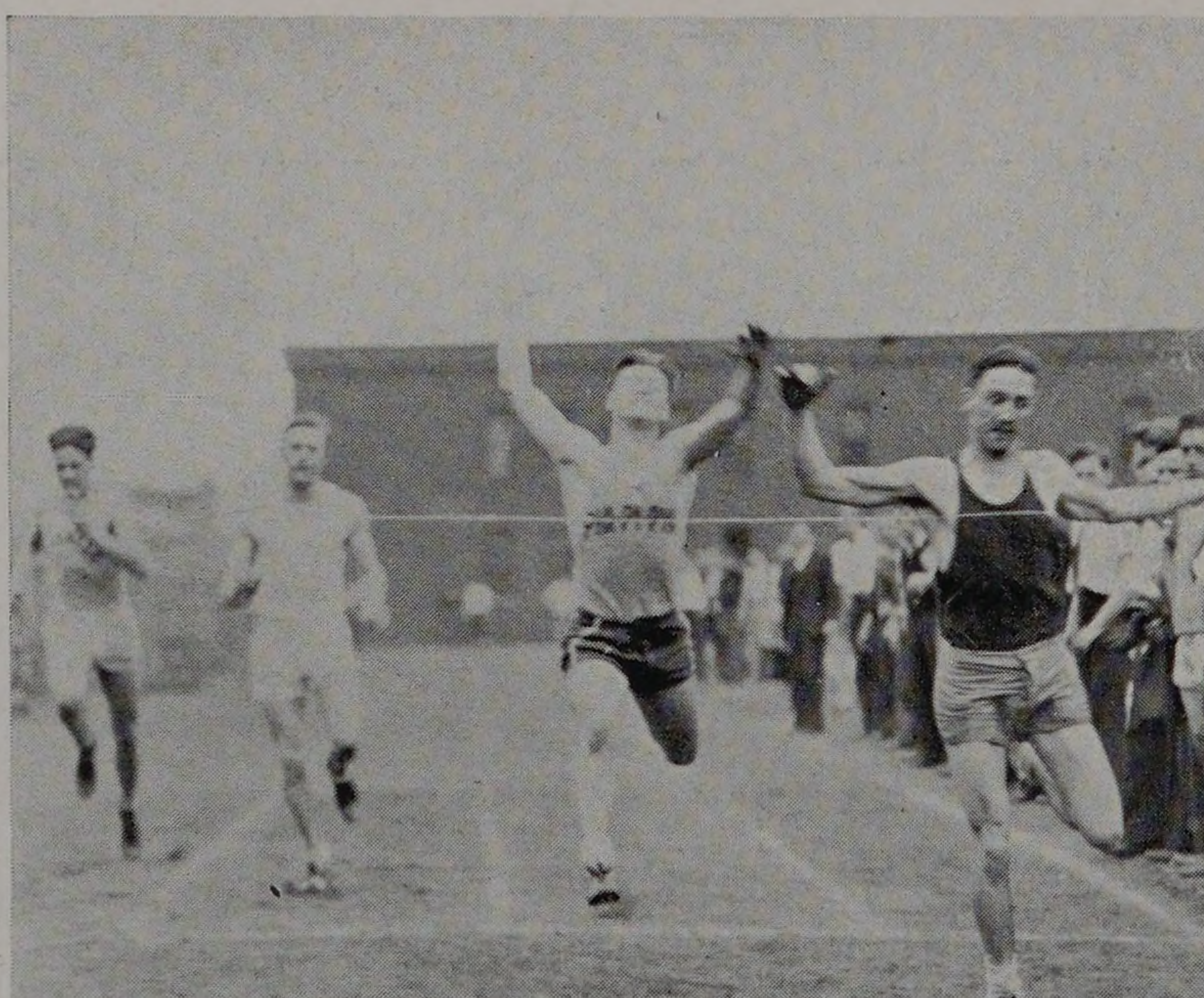
Reed Breaks the Tape

Clouds and rain were visible on Friday morning, Circus Day, but they failed to affect the enthusiasm which had made itself felt all during the week. As the clouds disappeared the Juniors proved their superiority in track events by capturing the Interclass