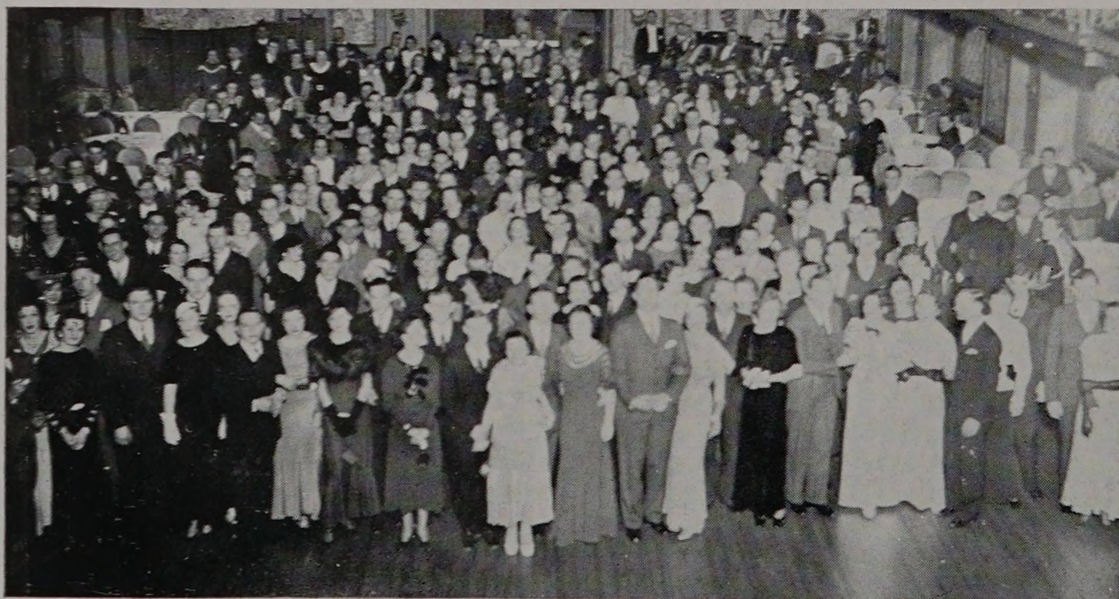
Senior Informal in the Gold Room of the Congress Hotel