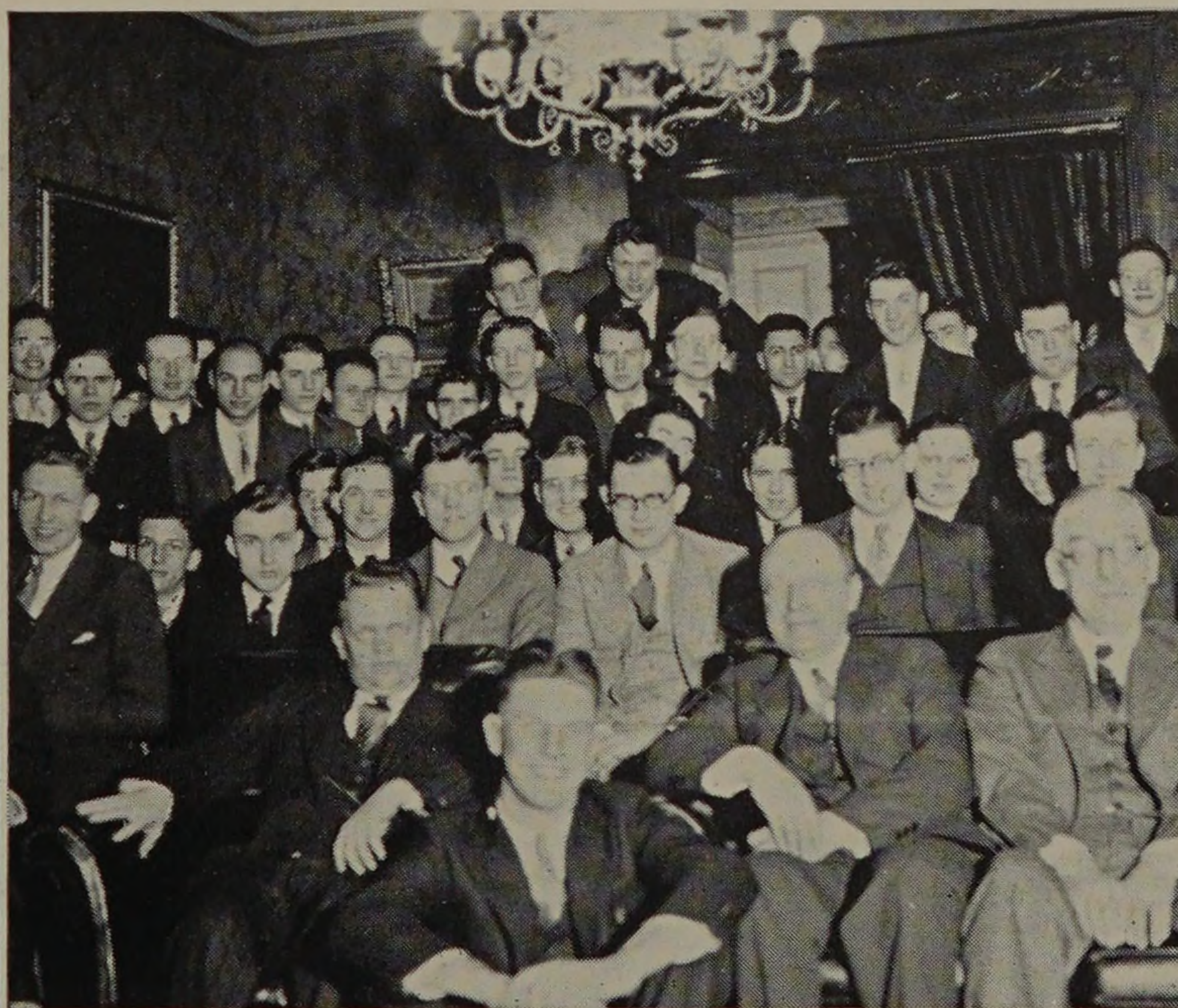
Right in their element