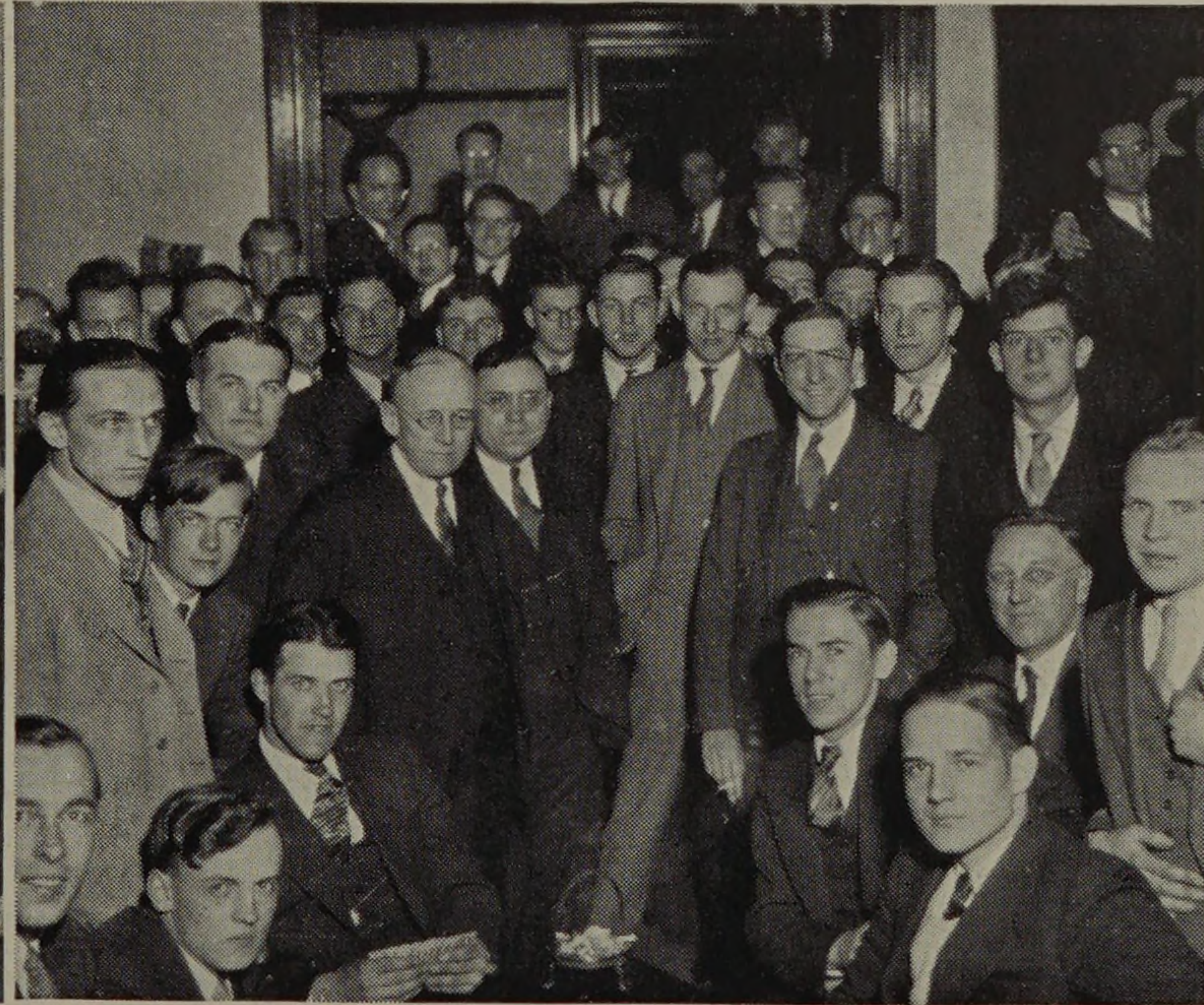
And more smoke