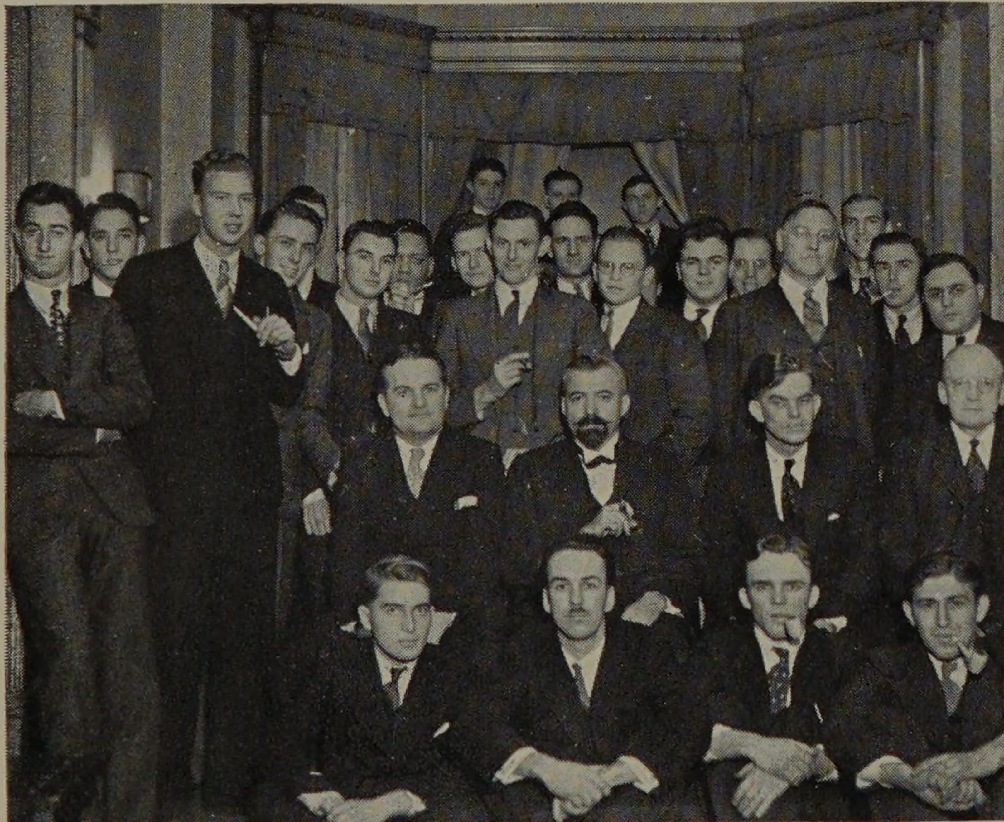
December 14 smoker