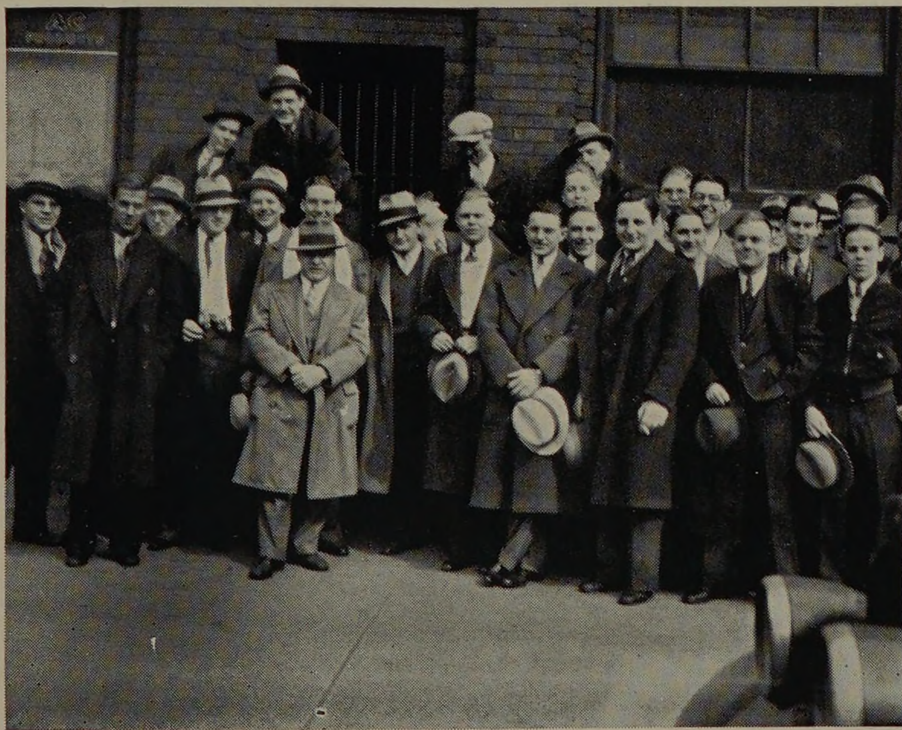
Three inspections in one day