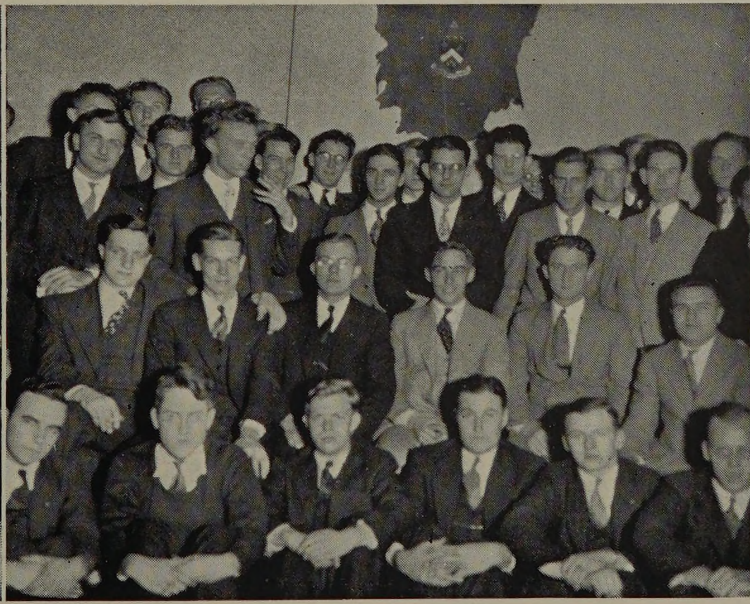
Annual A.S.M.E. smoker