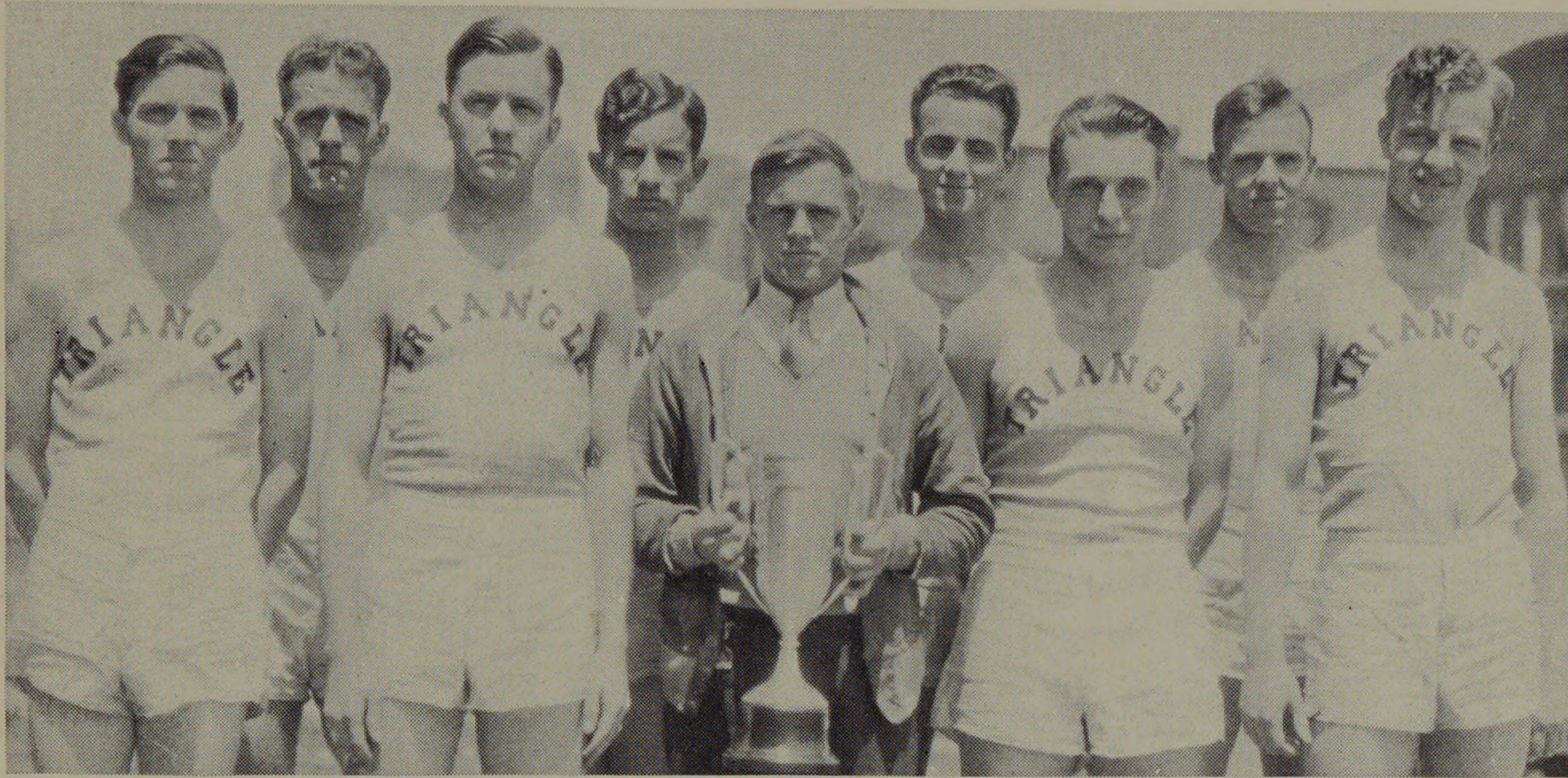
Triangle Interfraternity Track Champions