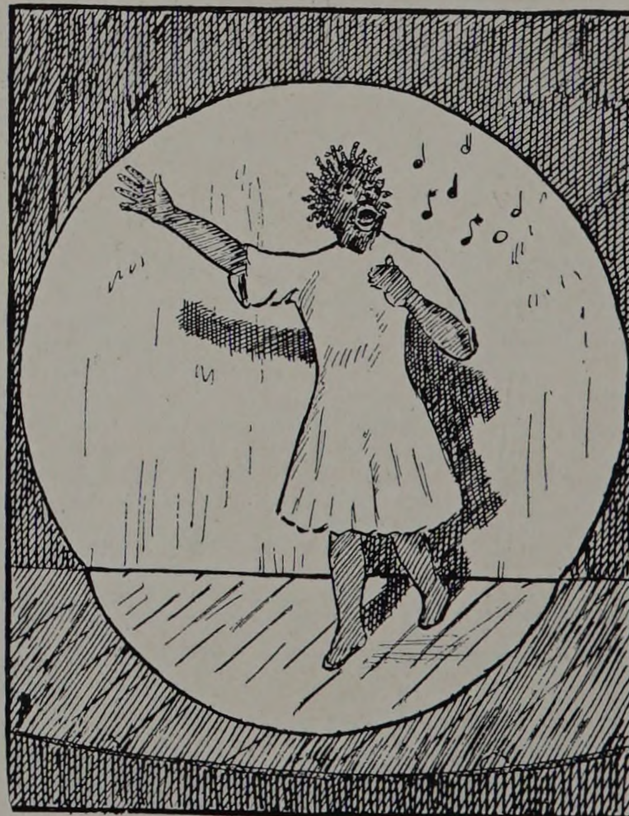
A Little Light on a Dark Subject