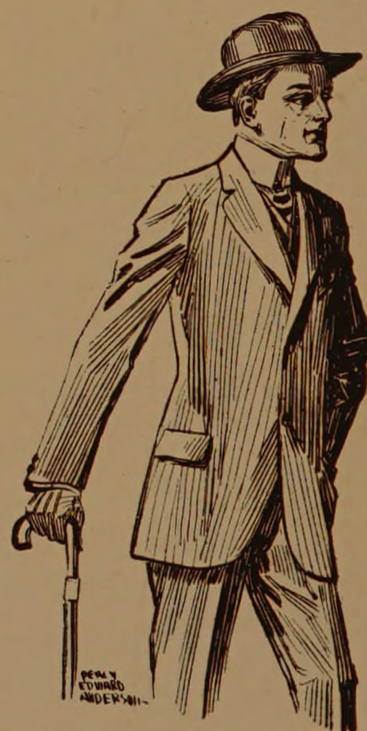
(Conservative-Model 30) Shop B

(Charge accounts solicited with responsible people)