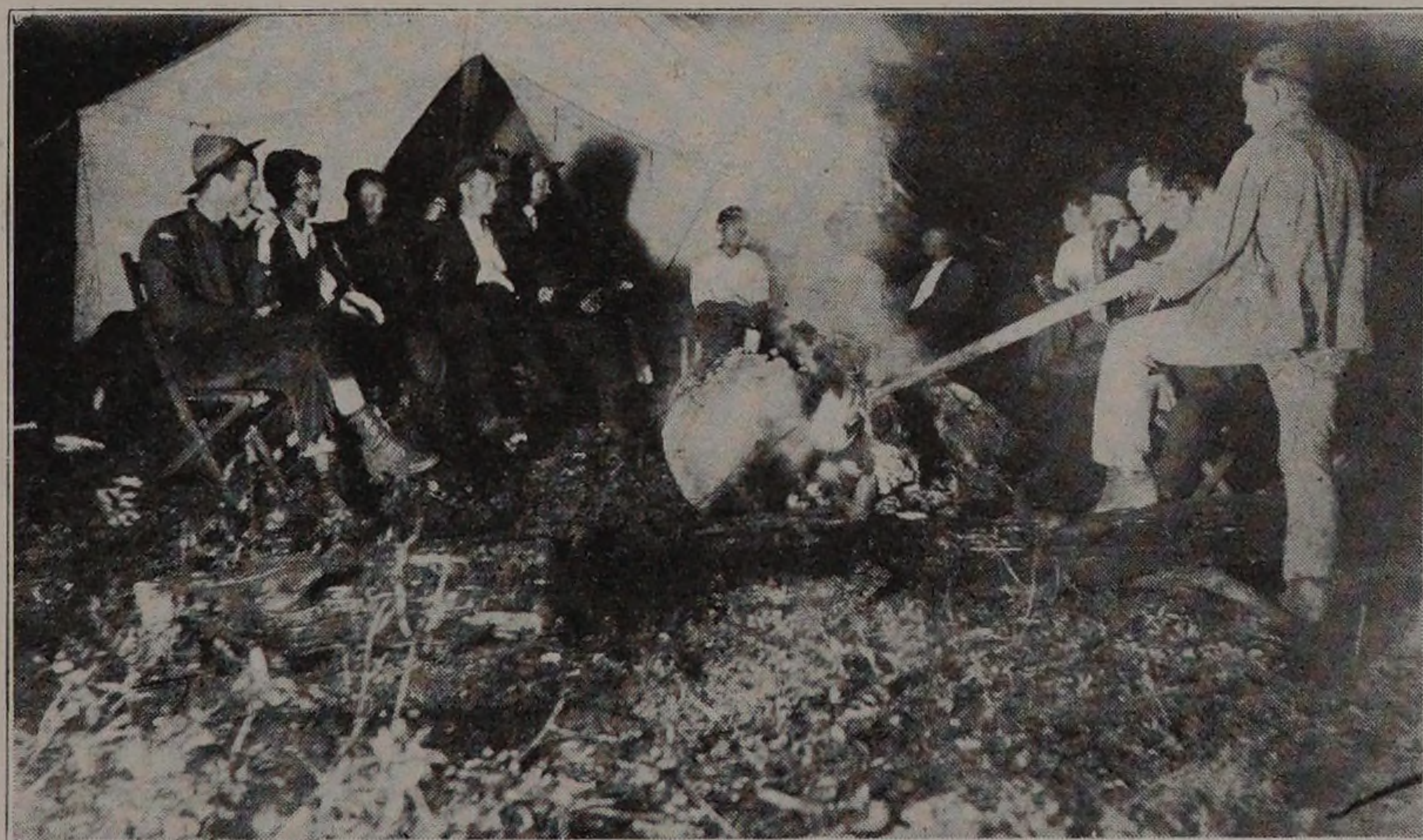
IN THE GLOAMING

July 18. Another baseball game is pulled off with Pembina. We win, 25 to 19.