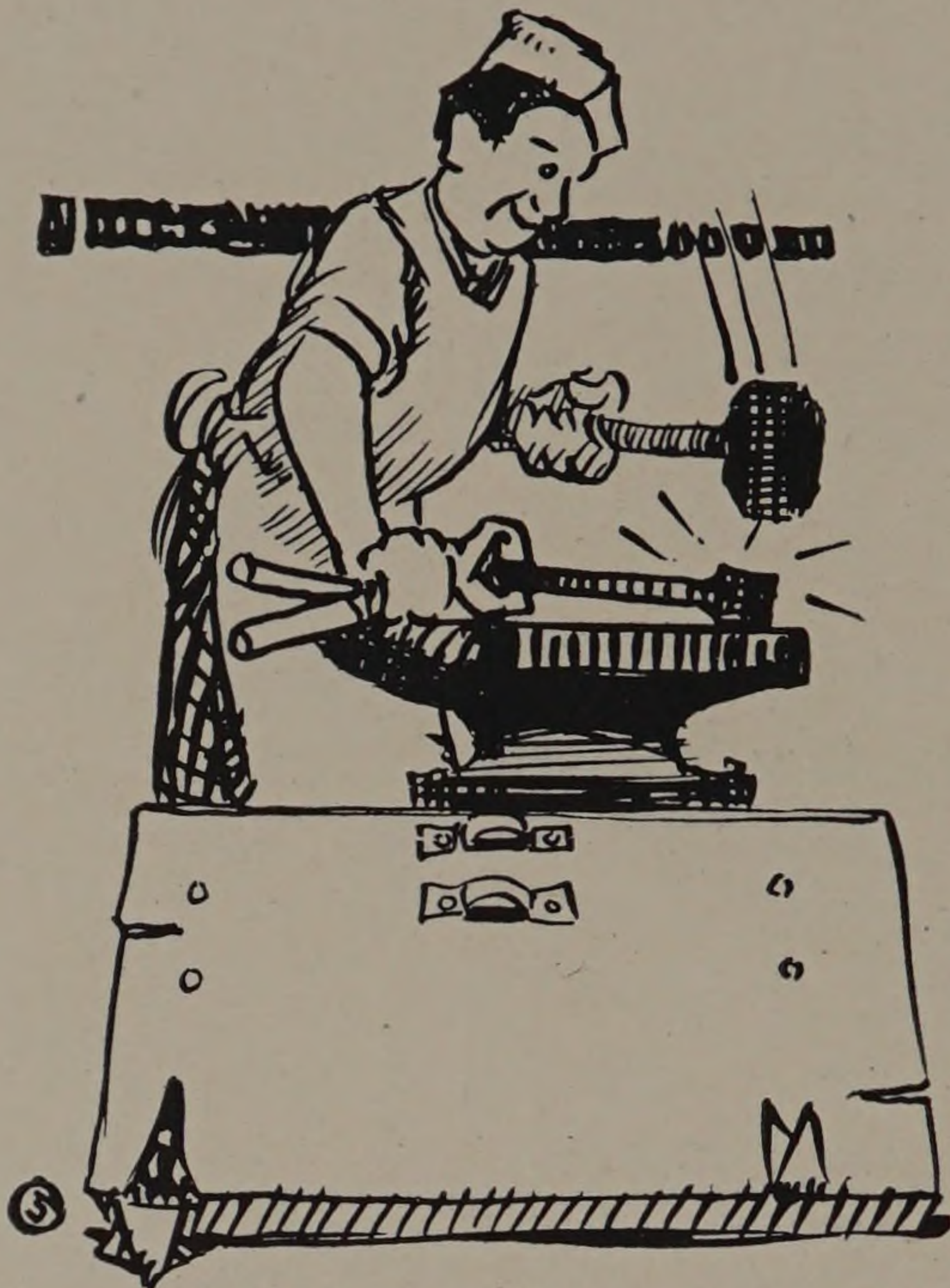
"He Made a Bolt for the Door"