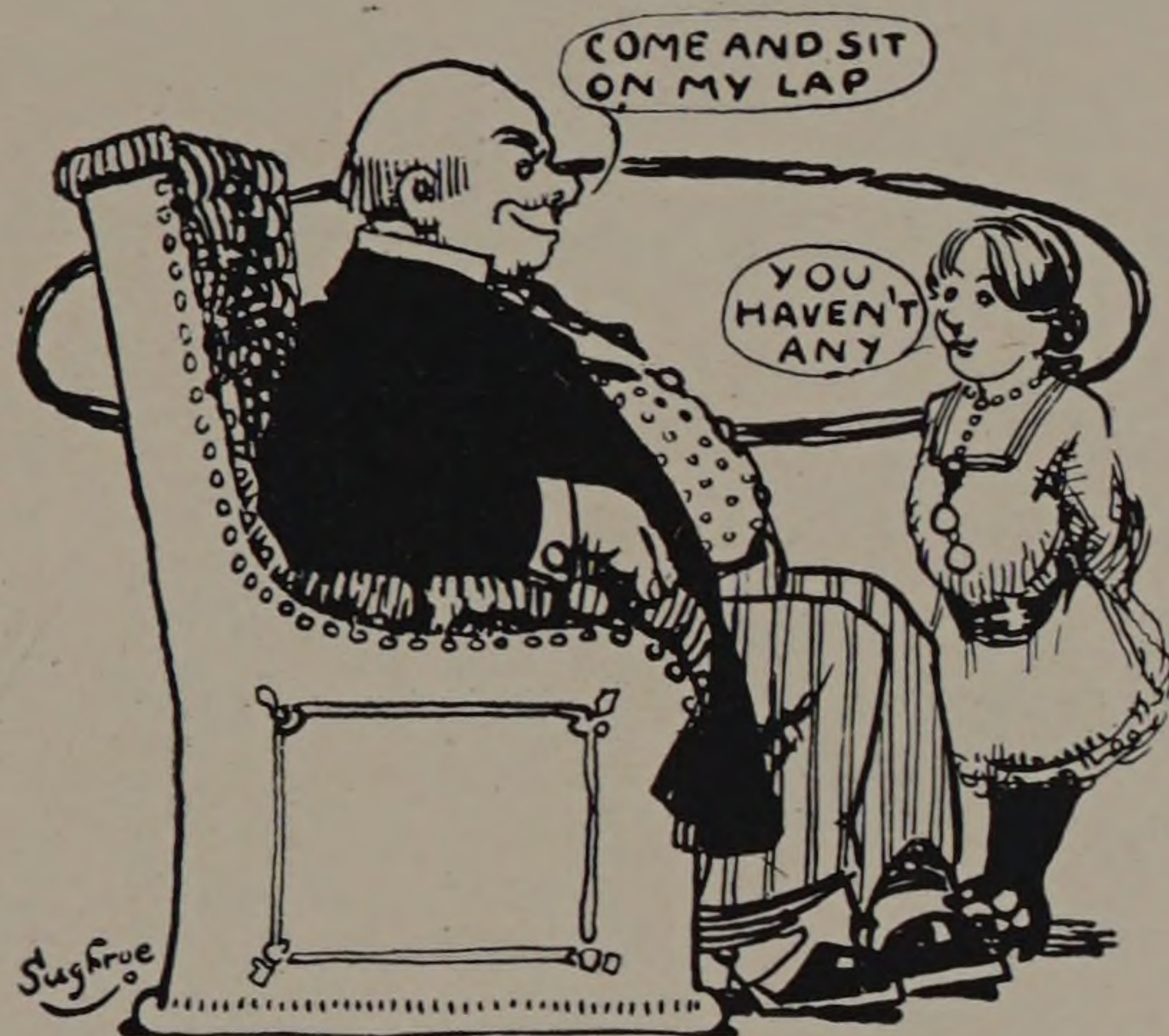
A Negative Lap

Freshie:—Judging by the noise last night, they must have chivareed that newly married couple in the flats.