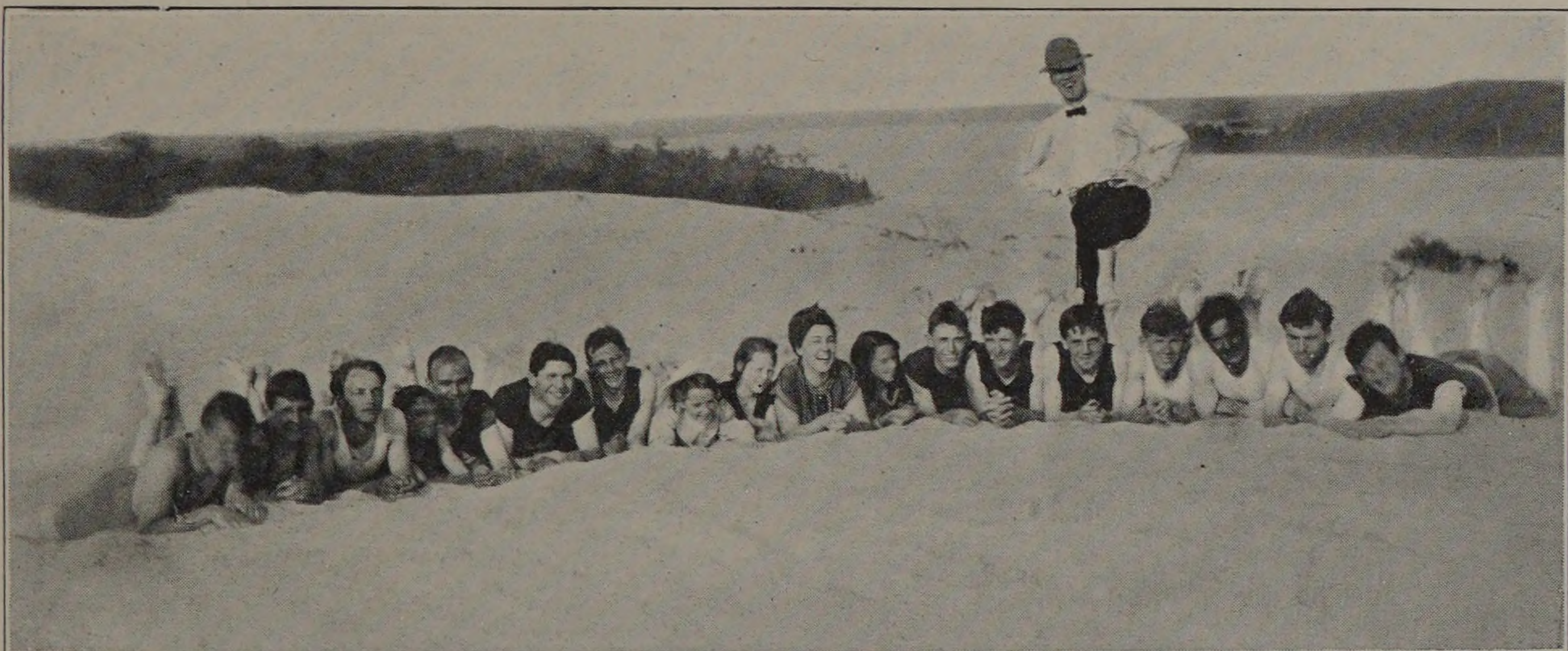
One of the Pleasures of the Summer Camp