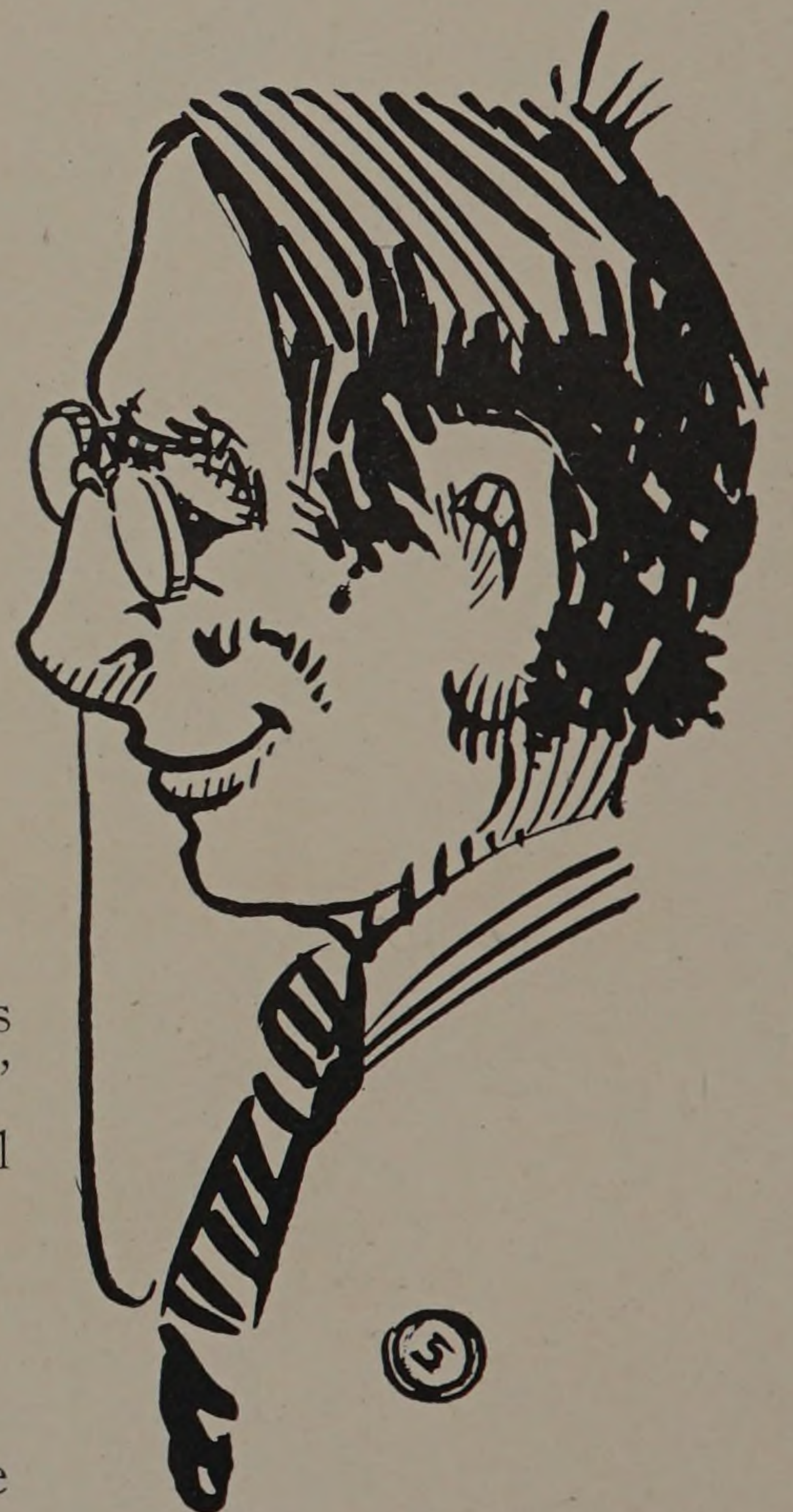
"Slip-Stick"—A Study from Life.

"Agate knife edges are most often used because they are less likely to rust than steel."