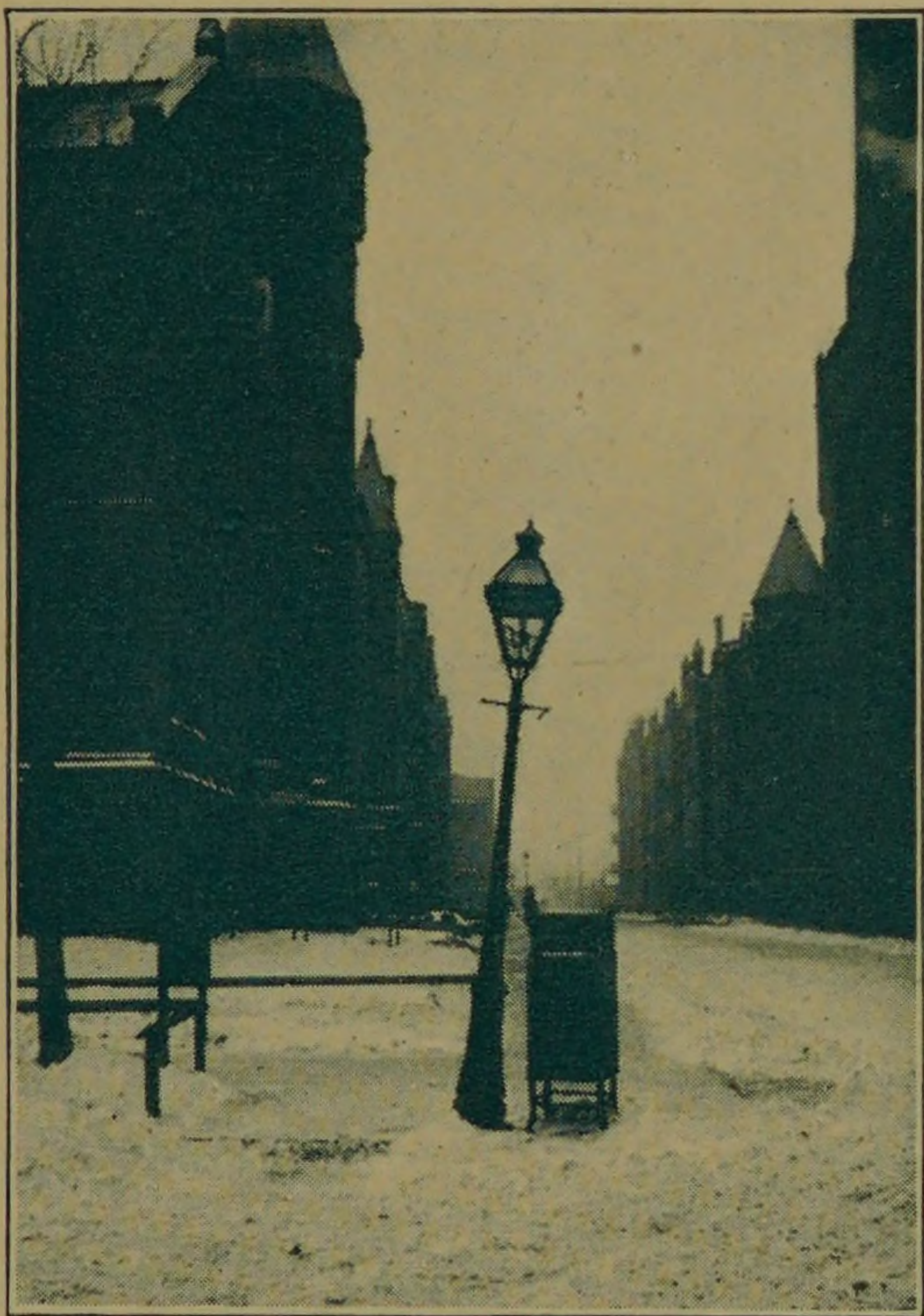
THE LEANING TOWER OF ARMOUR