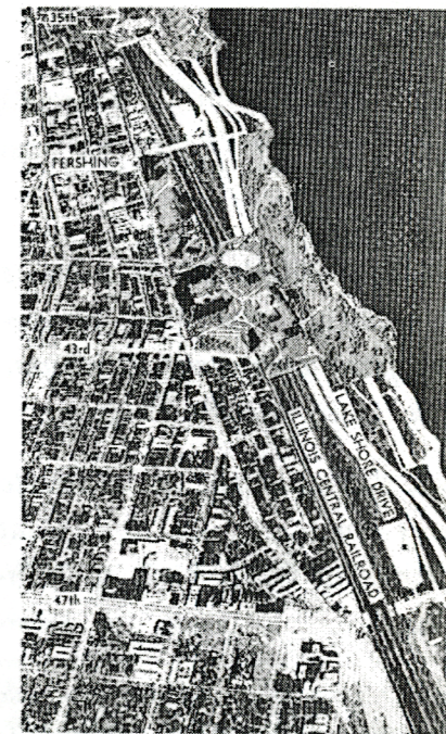
EARTH BRIDGES AT 35th ST. AND 43rd ST. WITH COMMUNITY FACILITIES

and providing protected harbors. They would, however, move the shoreline farther away from the residential community, and would require extensive earth moving.