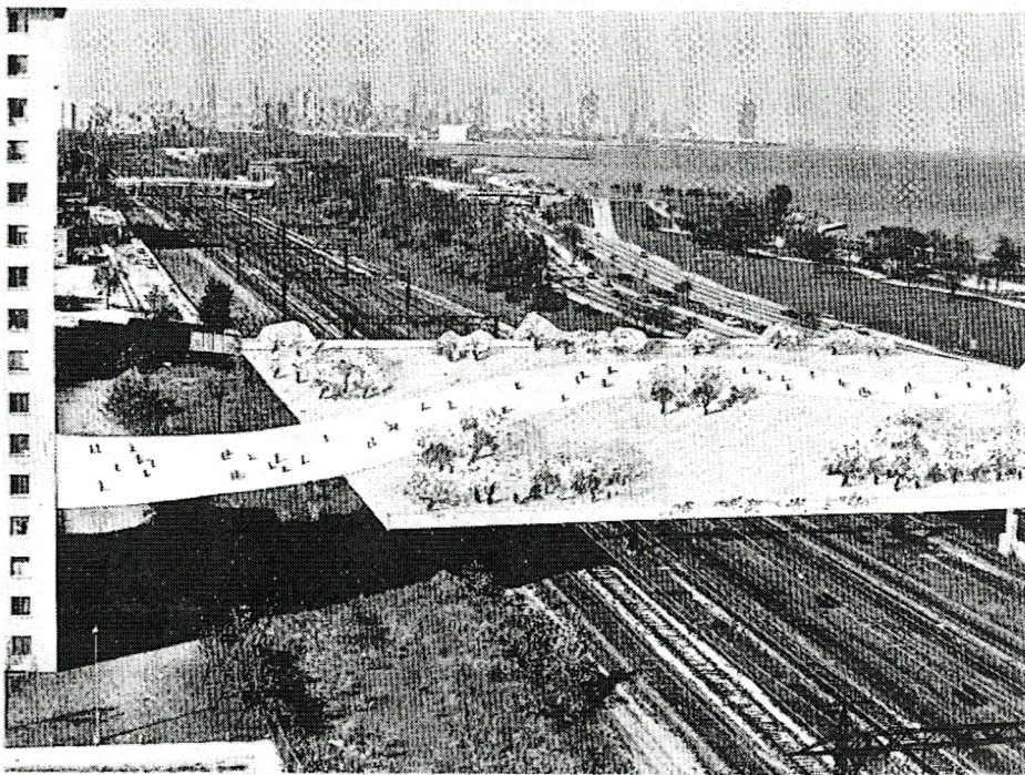
VIEW OF EARTH BRIDGE NEAR 43rd STREET

To the people of North Kenwood-Oakland, the lakefront is virtually inaccessible without a car. The steep, narrow stairs and pedestrian bridges are totally useless to the elderly, mothers with shopping carts or strollers, or children on bicycles. A stroll to the Lake in the summer is a struggle with cars, stairways, curbs, and other obstacles.