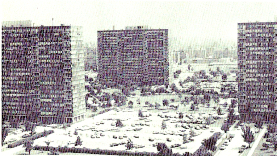
HIGH RISE WITH OPEN PARKING — LAKE MEADOWS

Use of the high rise building can offer a great amount of community open space if the parking is underground. The photograph of Lake Meadows shows the large amount of open space which could be used for schools, parks, and community facilities, if the parking were underground, as in Lake Point Tower.