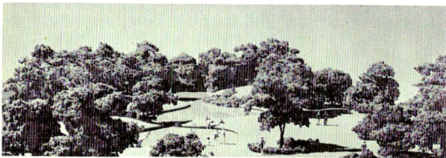
LANDSCAPED DECK OVER PARKING GARAGE — LAKE POINT TOWER