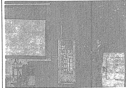
MUSIC RIDES MICROWAVES generated by intricate equipment to be demonstrated here Tuesday in AIEE-sponsored show.

Traditions will fall by the wayside as male students seek to prove that the gentler sex are not the only ones adept in the art of calefactory processes. No dough will be spared to guarantee those attending an edifying afternoon as Techawks vie for top honors in the cake-baking contest on Saturday, May 6, in the NU cafeteria.