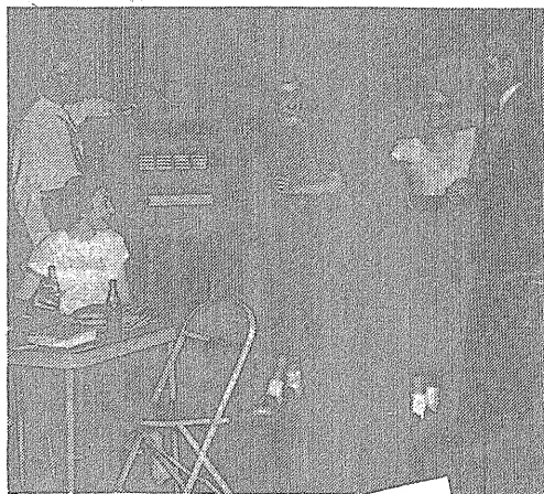
Grand Rapids Room University, Michigan (Ann Arbor)

Tuesday night, Delta Tau Delta will meet Theta Xi in the game which will either clinch it for the defending champs or put them in deadlock with the Alpha Sigs for first place. This, of course, is assuming that TX will reel off victories against a few of the lower position squads, which they certainly will be favored to do.