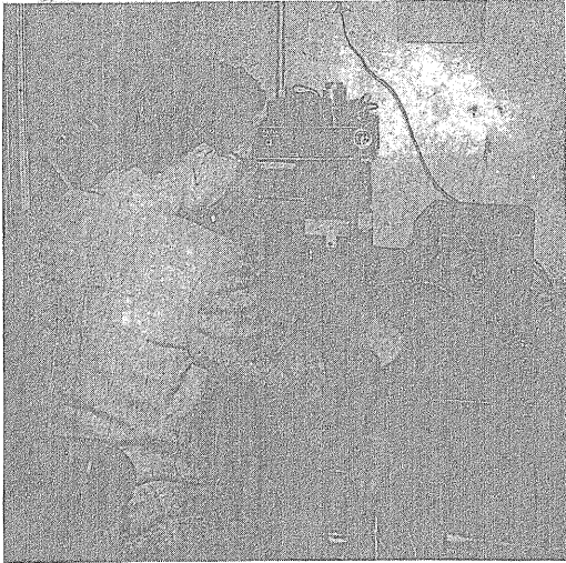
UNIDENTIFIED STUDENT works on sound system piping music to Student Unions. Spot announcements and recorded campus commercials will soon be started.