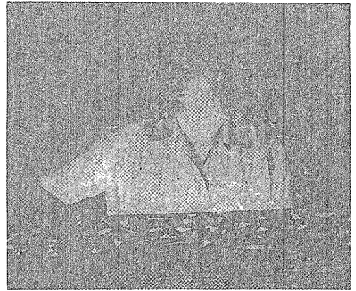
SPACE RELATIONSHIPS are tested by the Minnesota Form Board, one of the many tests available at the Institute for Psychological Services.