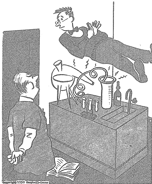
Let's stick to the regular text book experiments!