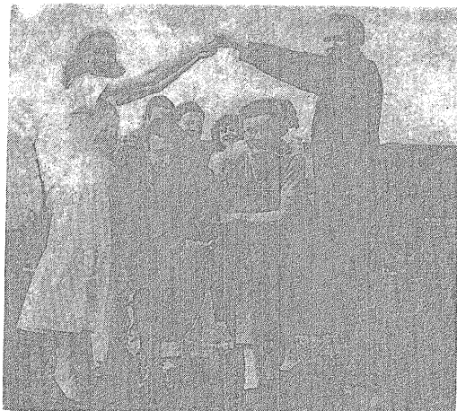
LIGHT-FOOTED TECHAWKS gambol on the green in eager anticipation of Wednesday night's frolic.