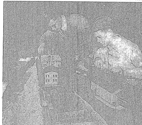
ENGINEERS shunt freight cars at Model Railroad exhibit.

Officially, too, the Prom winds up the ceremonies. Presentation of awards to Open House and fraternity winners and enthronement of the Pair of the Year as King and Queen of the dance fill the closing chapters of the 1950 Junior Week story.