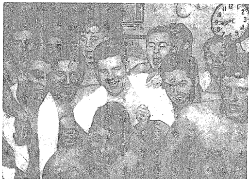
AH! SWEET VICTORY! The IIT Mermen pose for the photographer after trouncing George Williams 43-32.