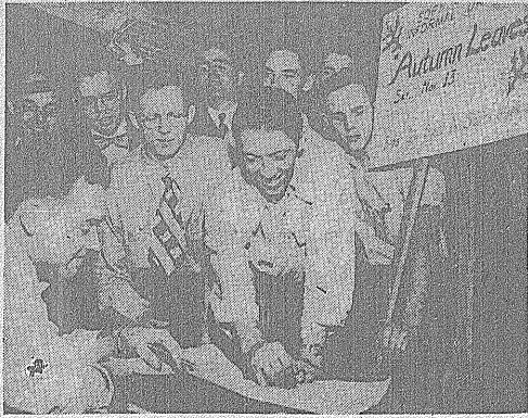
EAGER THRONGS of Techawks lay their money on the line for bids to the sophomore dance, Autumn Leaves, to be held November 13 at the Lake Shore Athletic club. The number of couples has been limited to 300.