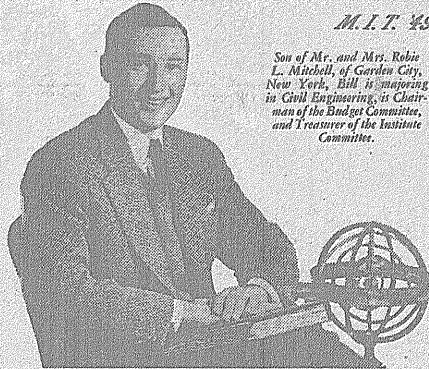
M. I. T. '49