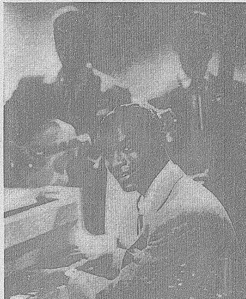
HIGHLIGHTING THE OPENING DAY ceremonies of the charity fund drive, will be King Cole and his famous recording trio. This newly instituted annual drive will replace various collections during the year.

An all-school assembly in the NU auditorium on Tuesday, April 19, will launch the first unified charity drive at Illinois Tech.