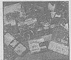
Cellophane has become the nation's symbol for modern packaging. Since 1927, continuing research has developed over fifty different types.

Diverse problems call for diversified talents. At any one time, there are hundreds of interesting projects under way in the Du Pont laboratories. You may be trained in chemistry, engineering or physics. You may have studied in the fields of botany, entomology, parasitology, pharma-