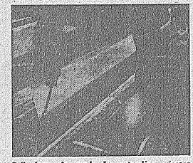
Cellophane is made by extruding viscose through a slit into an acid bath where it coagulates into sheets. Moistureproofing follows.