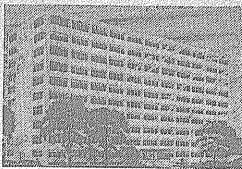
NEW ADDITION to Illinois Tech housing facilities is the above 10 story building to be built at a cost of $1,200,000.

Construction will be of reinforced concrete and brick and will conform