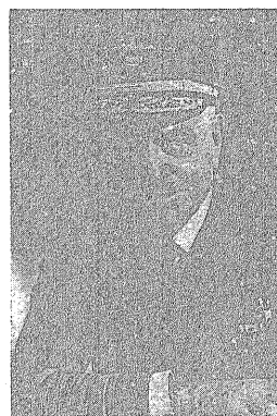
POWER CONFERENCE HEADLINER—Fleet Admiral Wm. F. Halsey, Jr. will be the featured speaker at the "All-Engineers" dinner meeting of the Midwest Power Conference on April 1.