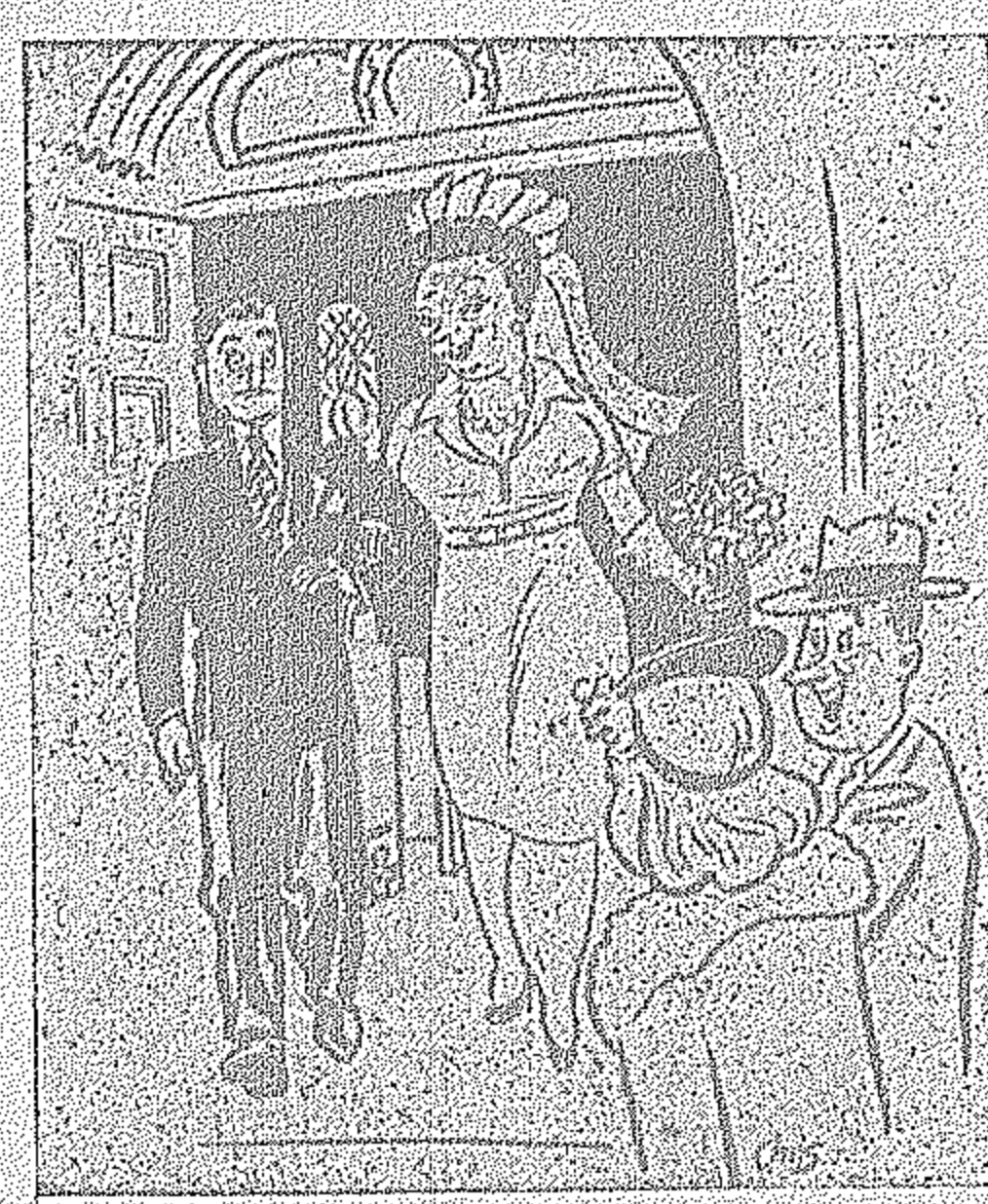
"She's not much to look at, but they say she can roll cigarettes like nobody's business."