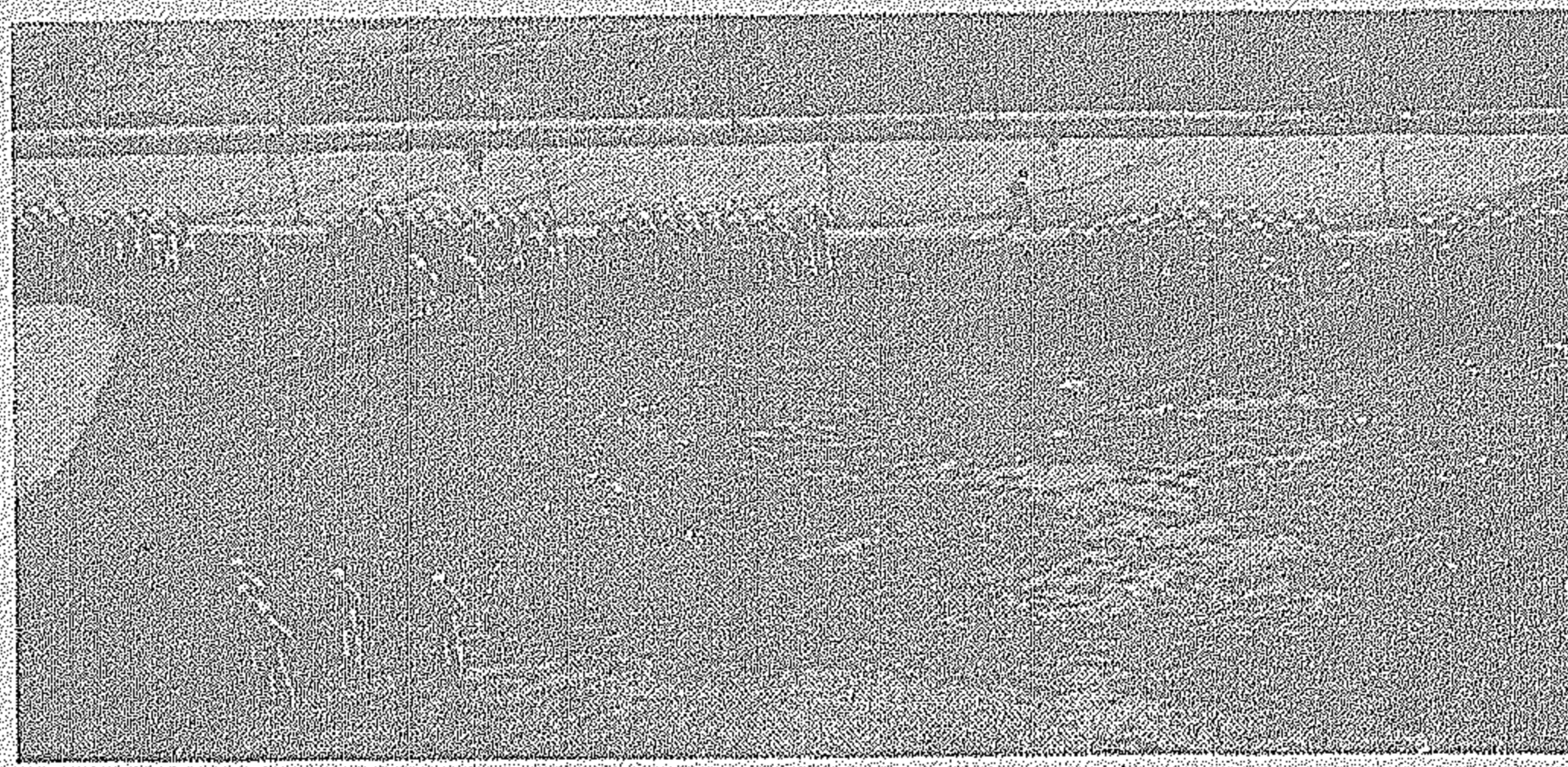
MORNING COLORS—Regular morning formation of IIT's V-12 unit in Ogden Field is pictured as seen from atop Machinery Hall.