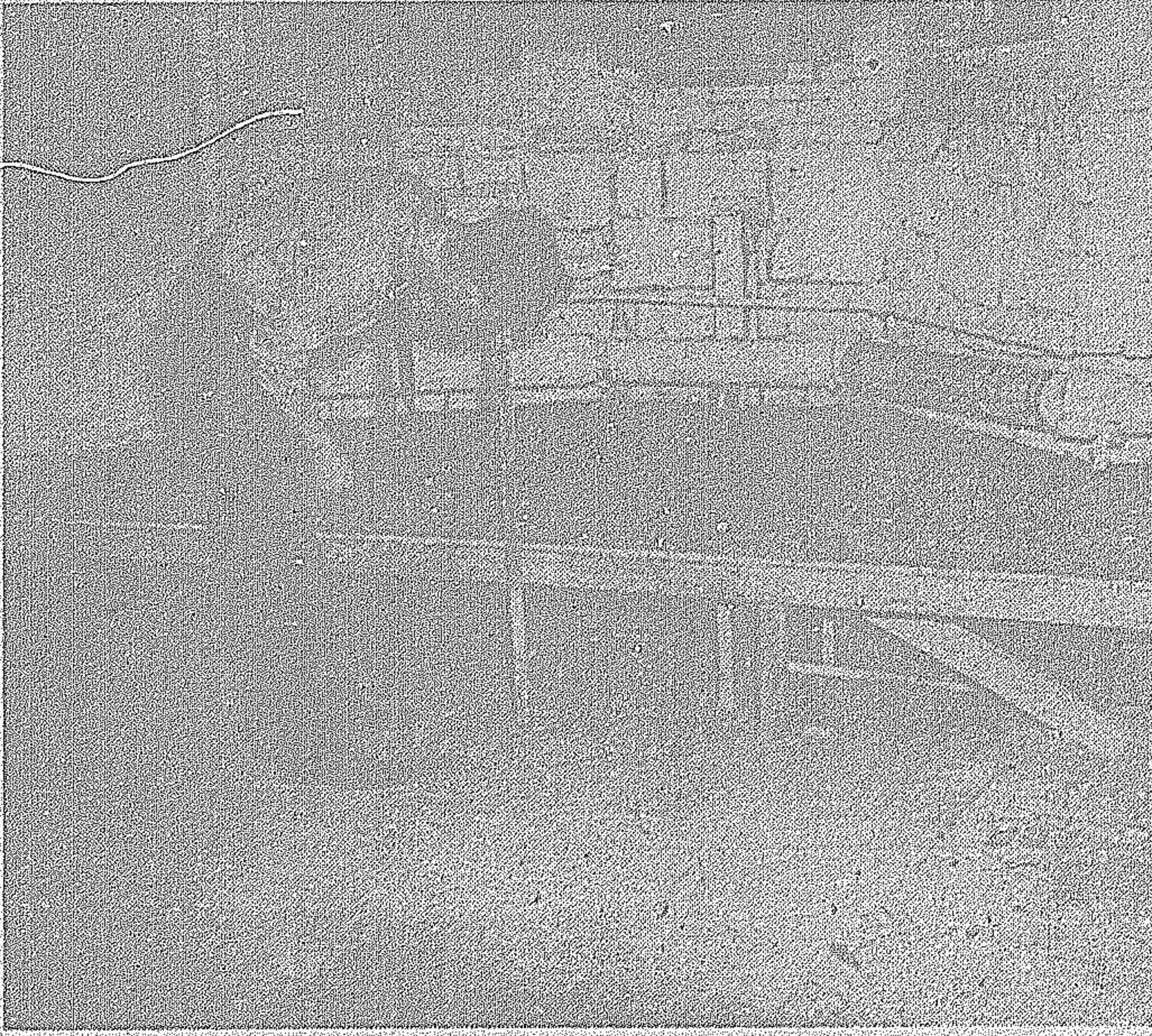
REPAIRED RANGE—Jack Schmidt examining the IIT rifle range after it was put in good order and repaired by the maintenance department.