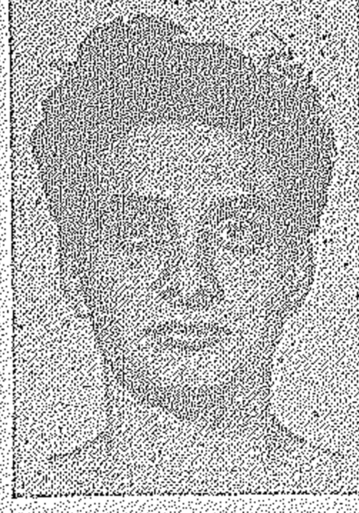
passed without much trouble.

Arenson's vocational interest is biophysics, which is a relatively new branch of science with many possibilities for research.