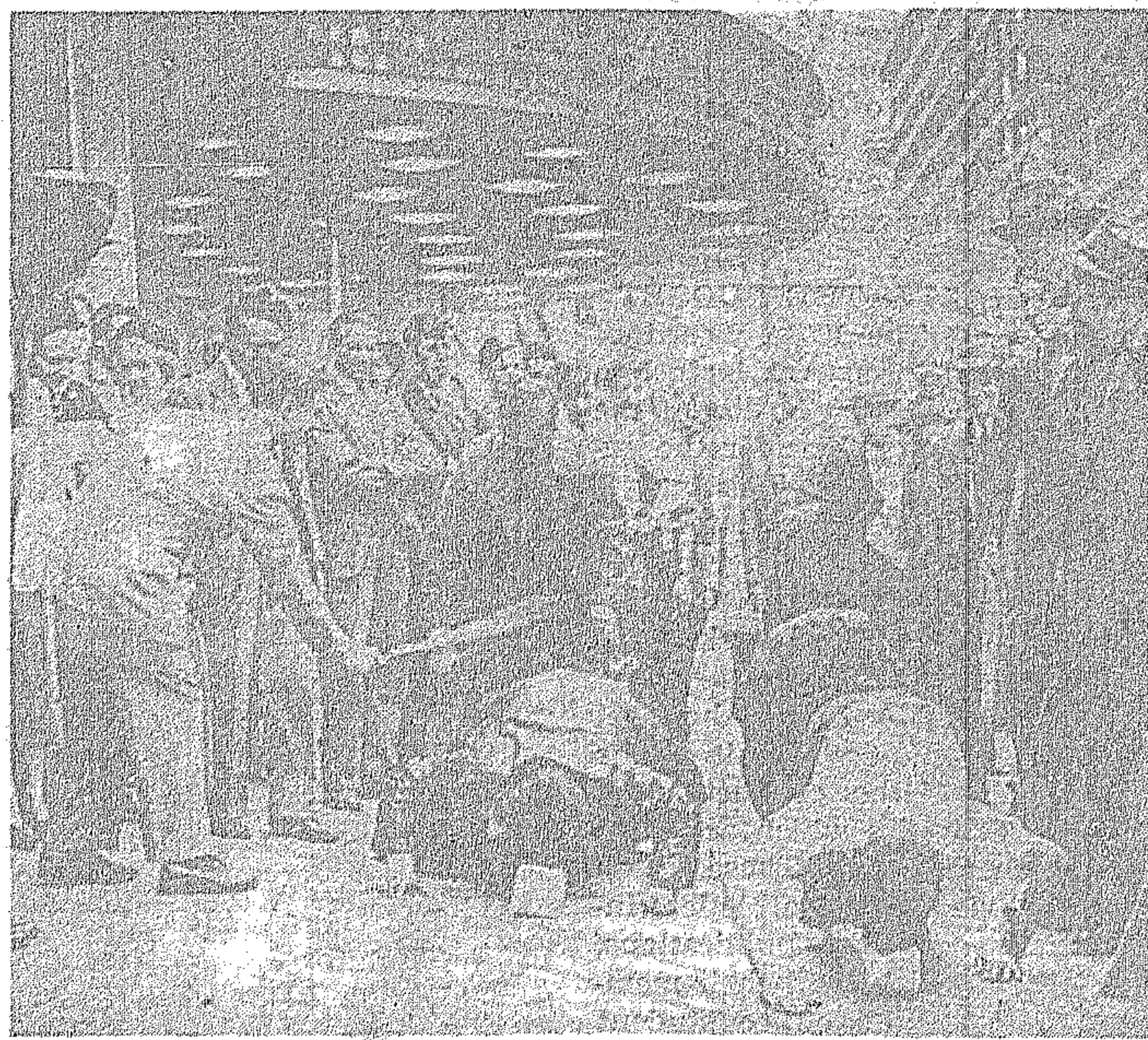
Two freshman Arx are shown in the photo finish of their Northern Tissue race during the Armour Architectural society's initiation in the Loop. The implements in the hands of the initiators are not Japanese fans.