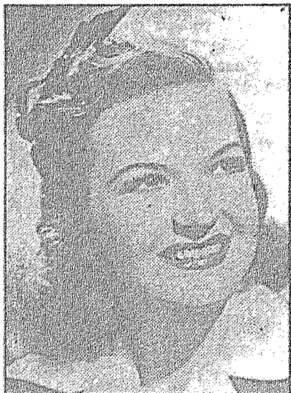
DONNA KING of the KING SISTERS