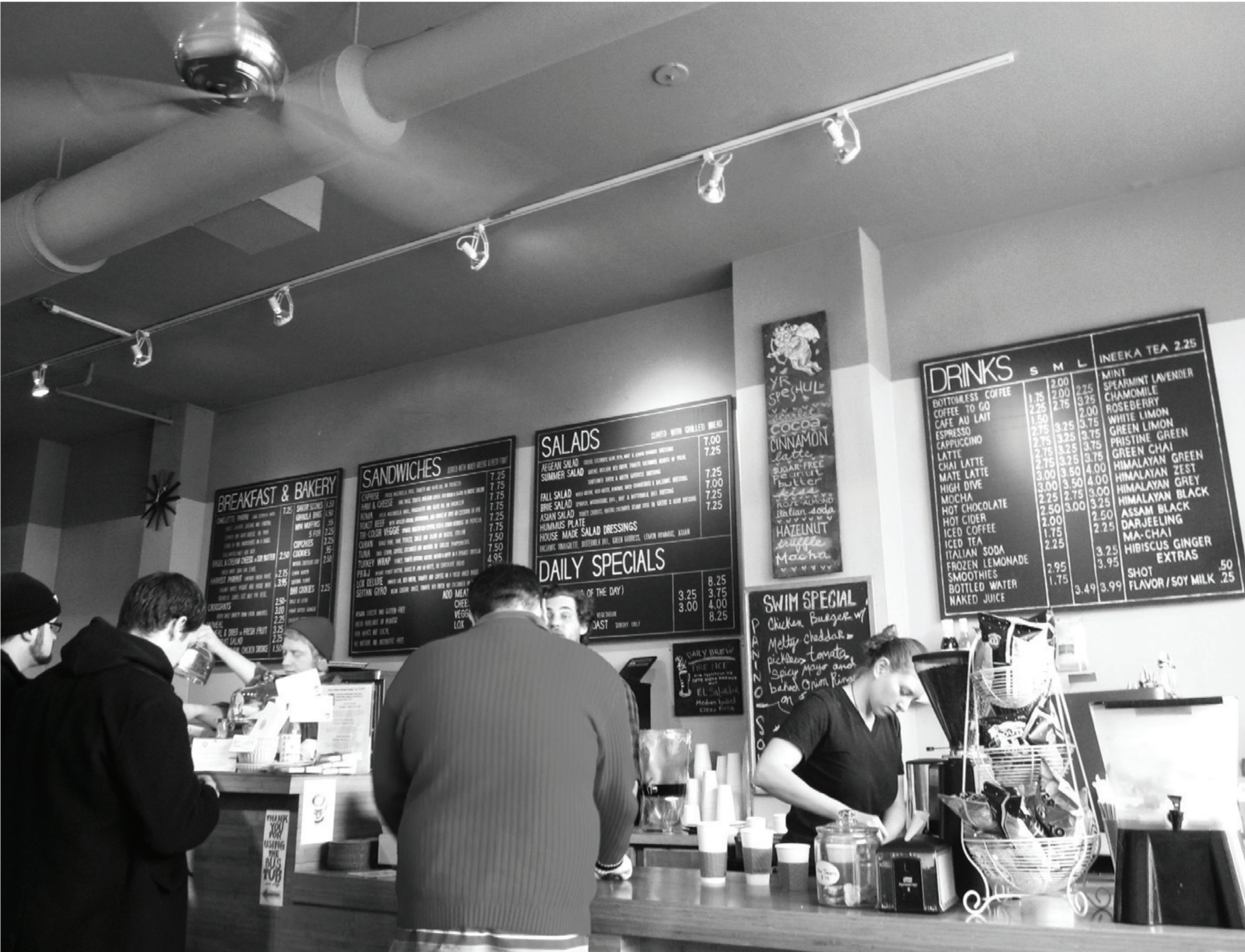
Take a dip in some of their perfect brews!

arrangement of the chairs and tables was also very appealing in this simple kind of way, much like one of those perfect cafés one sees in movies. The prices were reasonable, with a sandwich and a drink together coming to about $11. Although the café does not seem to have Wi-Fi, it does attract a lot of students, as it is the perfect place to sit down with a bunch of homework assignments, sipping your coffee and maybe even getting a bagel. Swim cafe is definitely a spot to check out. You won't regret it. Coffee Club is the perfect break from the mundane and a great way to see the little places you might miss out on otherwise. So if you want to join in, just email iitcoffeeclub@gmail.com to be added to their mailing list. Or even easier, just show up at 11 a.m. at the MTCC, next to Global Grounds on a Saturday or Sunday, and tag along with the group of people you see, onto the next coffee adventure..