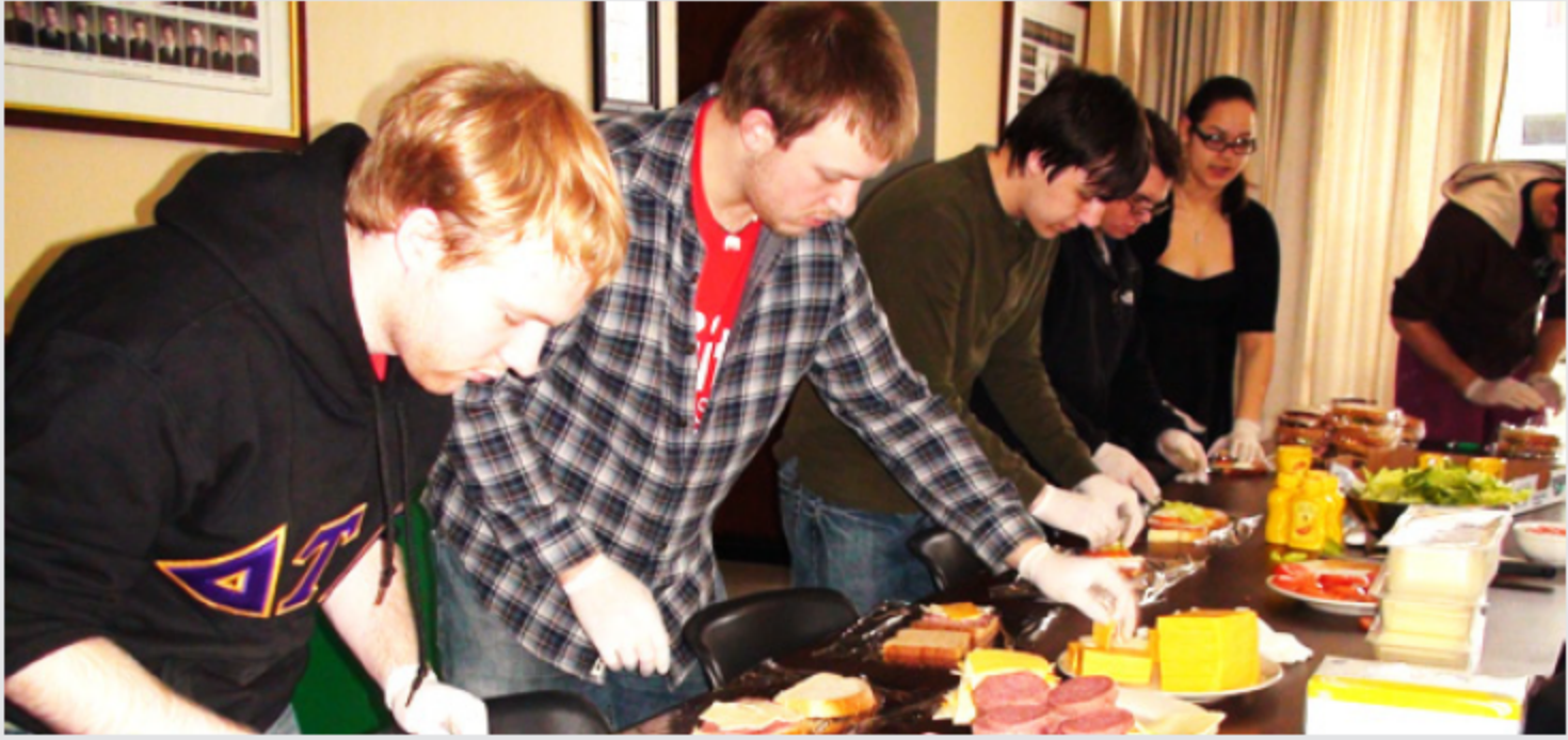
A line of sandwich makers hard at work for Greeks Feed the Homeless 2010.