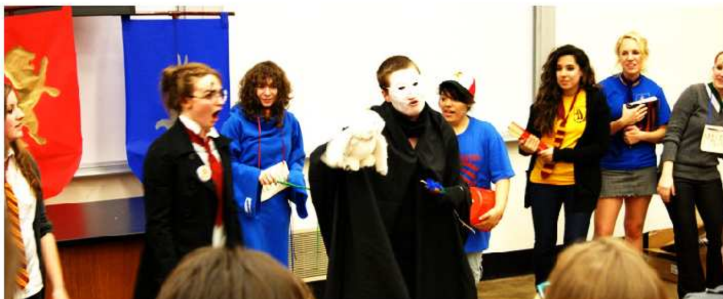
Kappa Phi Delta-Harry Potter