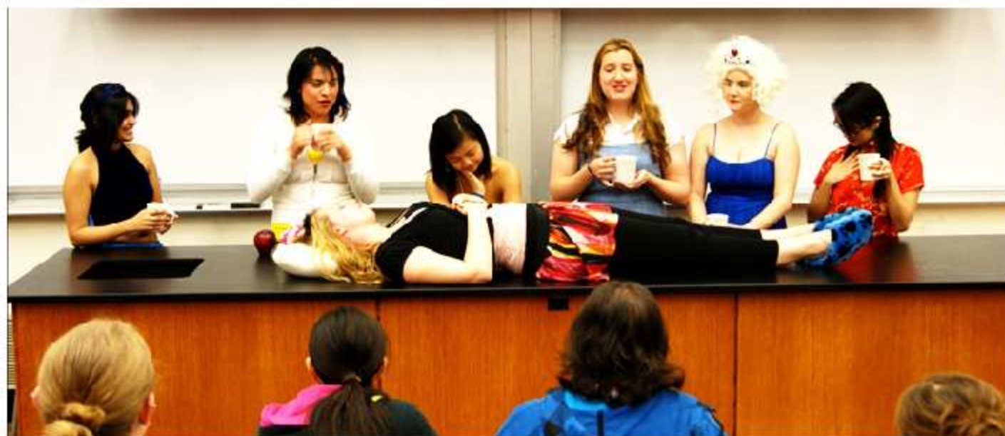
Alpha Sigma Alpha-The Real Disney Princesses