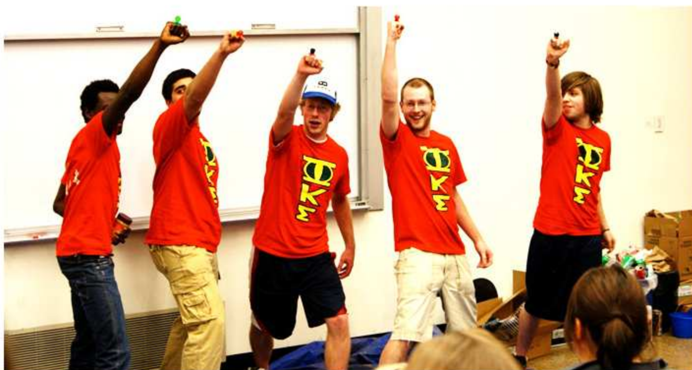
Phi Kappa Sigma-Captain Planet