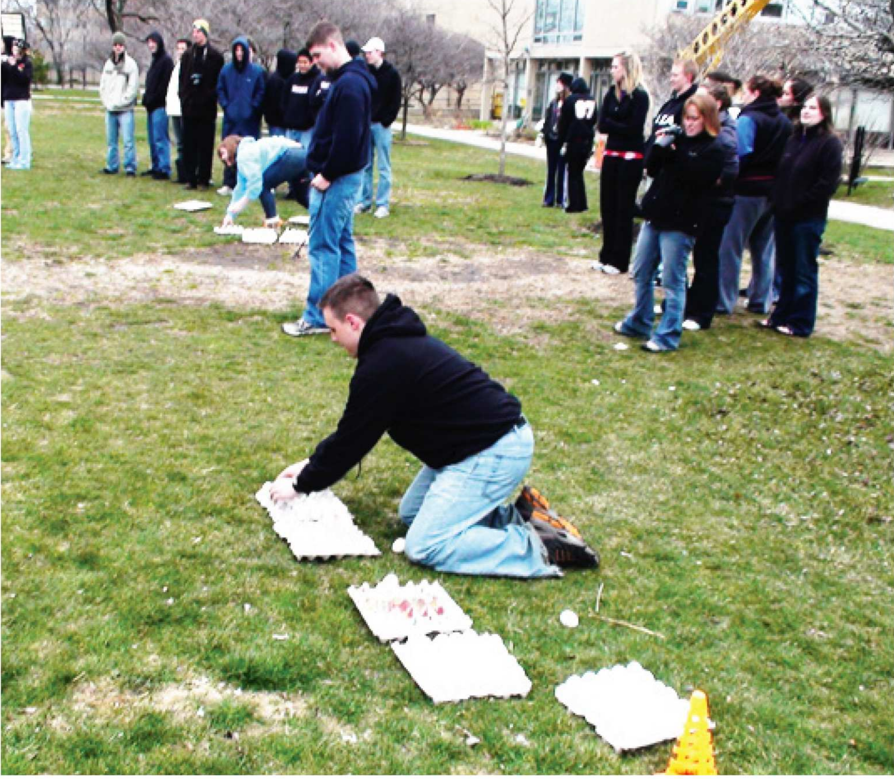
Left: IFC Sing-1950s. Right: Egg Toss of Greek Week 2009