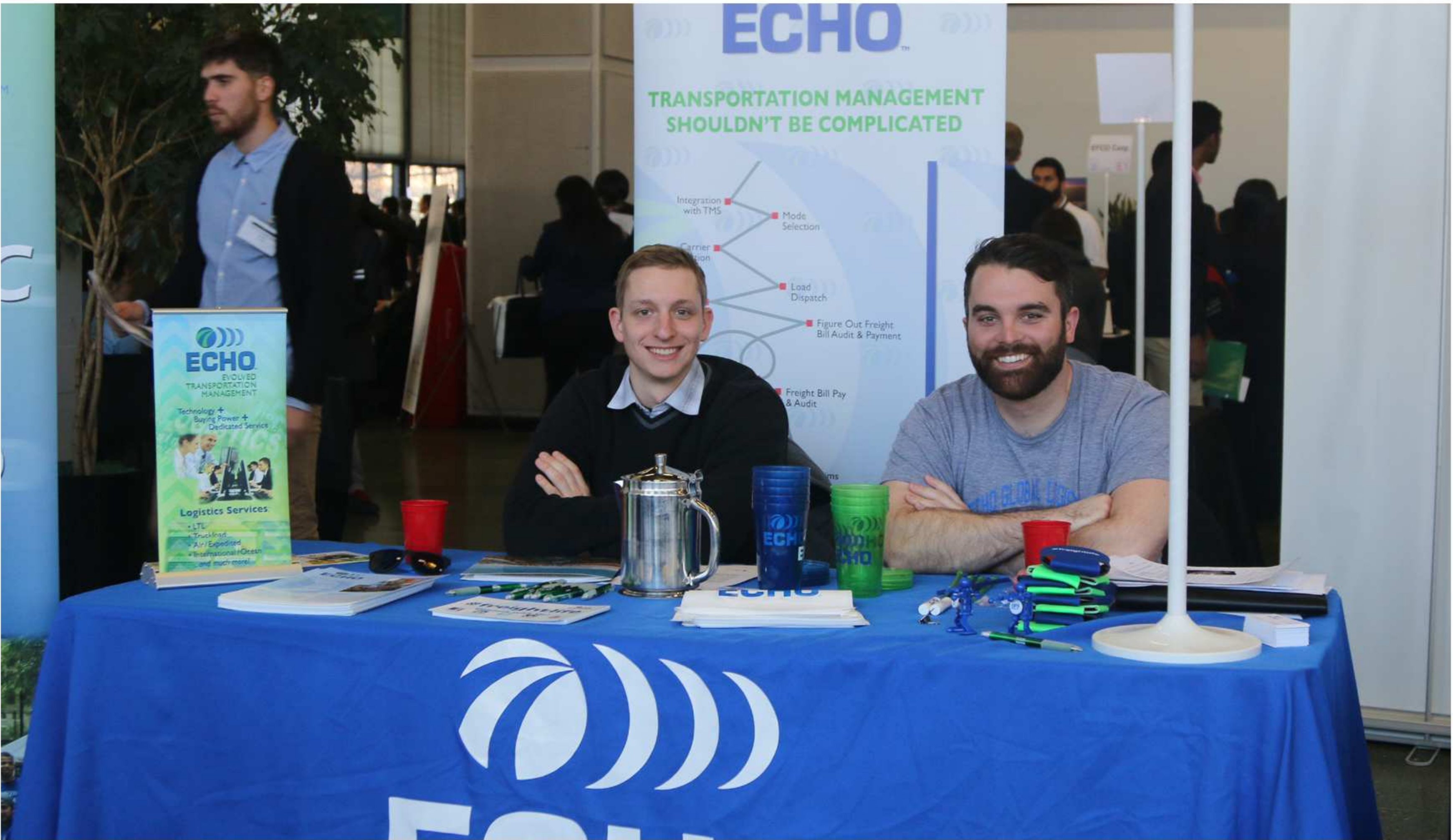
Photos of Spring 2015 Career Fair