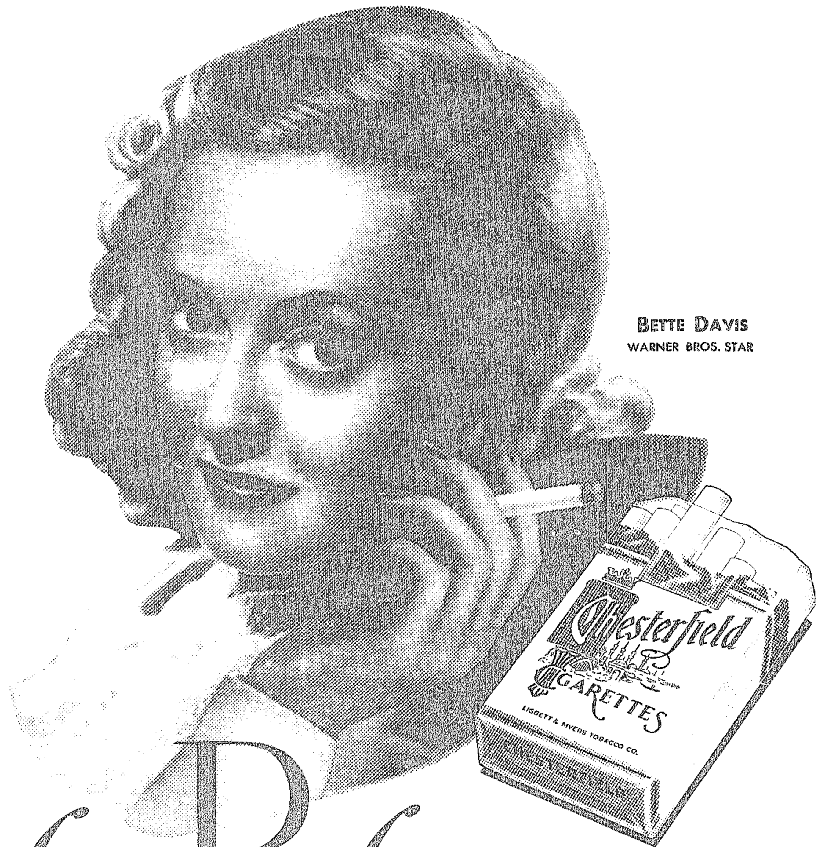
BETTE DAVIS WARNER BROS. STAR

Using towels for covering drawing plates, wiping out lockers, and other irregular uses is to be strictly avoided. Using three or four towels when only one is sufficient to dry one's face or hands will result in the old towels coming back. With these facts in mind the students are to be left to decide whether they want the new product with all its advantages, or the old rough towels.