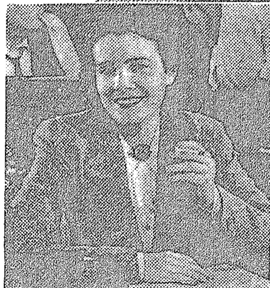
BENNY GOODMAN—King of Swing, and the world's greatest swing band—each Tuesday evening—Columbia Network. 9:30 p.m. E. S. T., 8:30 p.m. C. S. T., 7:30 p.m. M. S. T., 6:30 p.m. P. S. T.