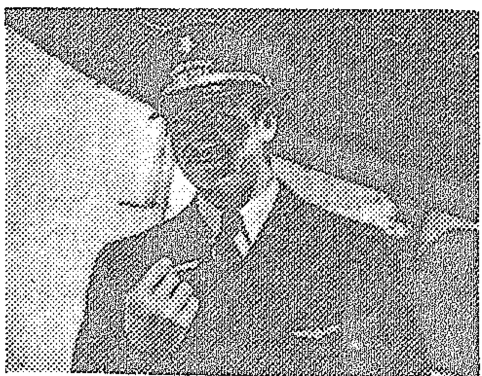
EDDIE CANTOR—America's great comic personality in a riot of fun, music, and song. Host Monday evening on the Columbia Network. 7:30 p.m. E. S. T., 9:30 p.m. C. S. T., 8:30 p.m. M. S. T., 7:30 p.m. P. S. T.