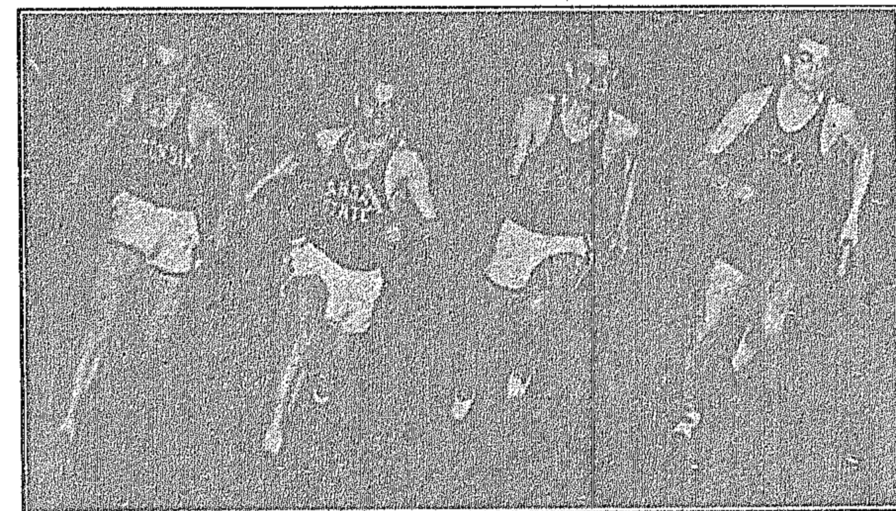
The First Turn in the University Sprint Medley Relay