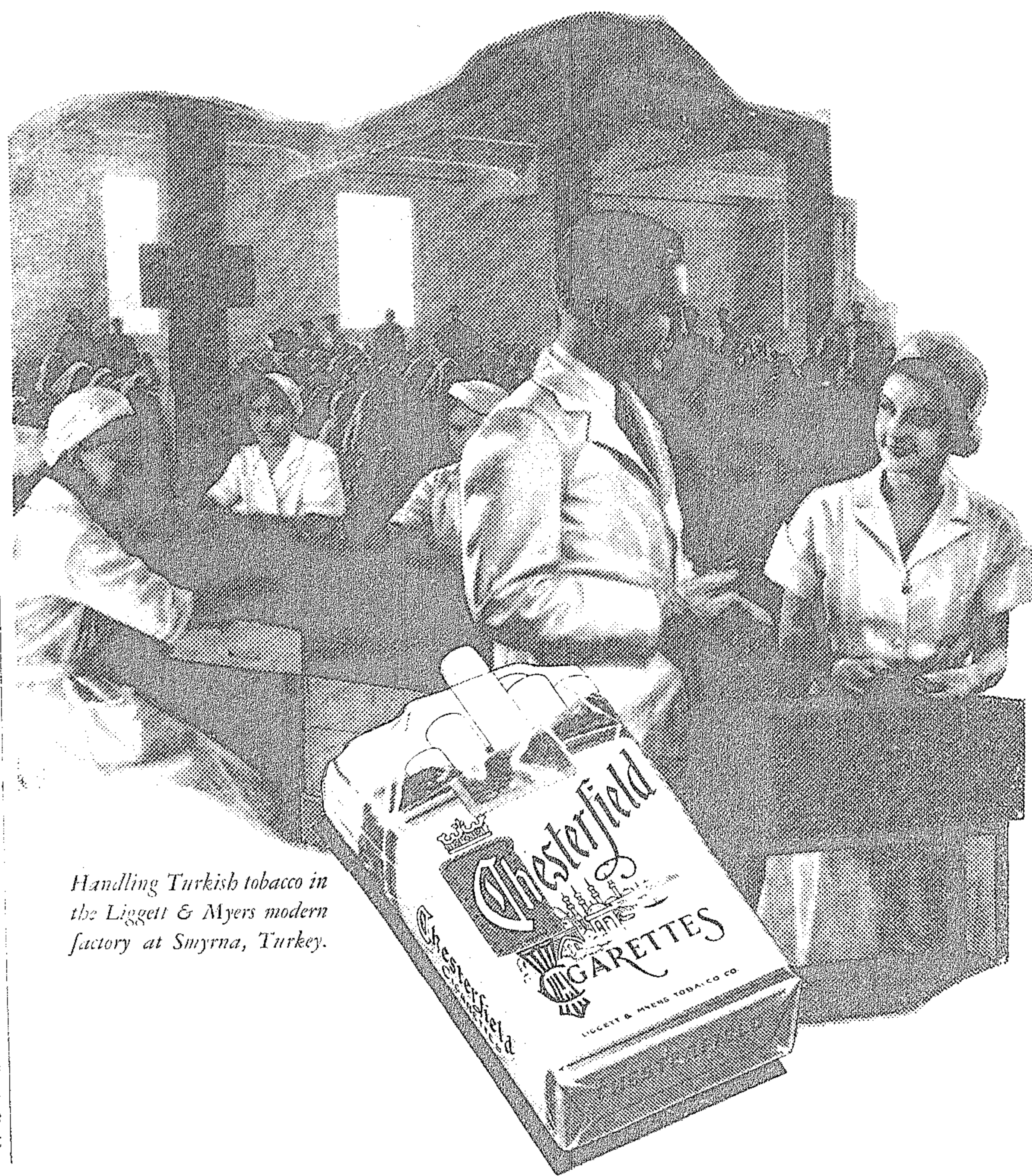
Handling Turkish tobacco in the Liggett & Myers modern factory at Smyrna, Turkey.

The selection, buying and preparation of the right kinds of Turkish tobaccos for making Chesterfield Cigarettes is a business in itself . . .