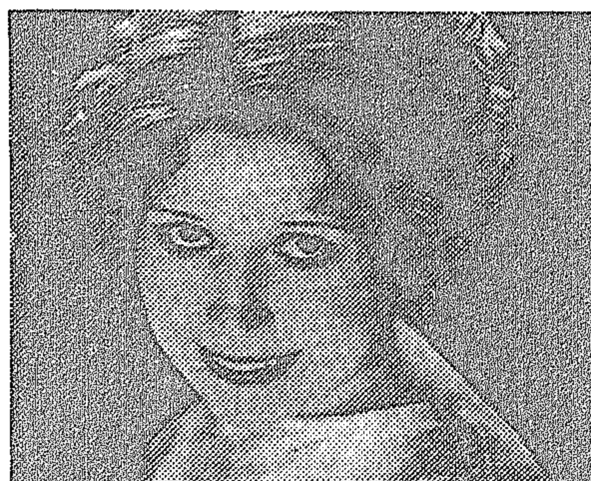
ANNETTE HANSHAW—whose thrilling, vibrant voice and sparkling personality have enthralled radio audiences in the past, will be featured on the new Caravan in the popular hit tunes of today and yesterday. It's better than even money she will soon be your A number 1 favorite radio songstress.