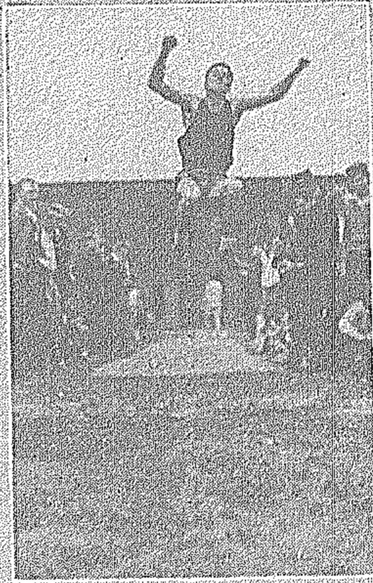
George Reed, high point man in the interfraternity meet, jumps 18 feet, 3 inches for a first in the broad jump. He also won the 100 yard dash, 220 yard dash and high jump.