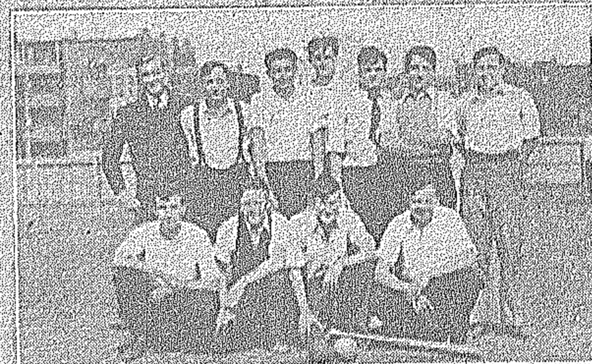
The sophomore softball team that beat the seniors in the final game. In the prelims, the seniors beat the juniors, and sophs beat the freshmen.