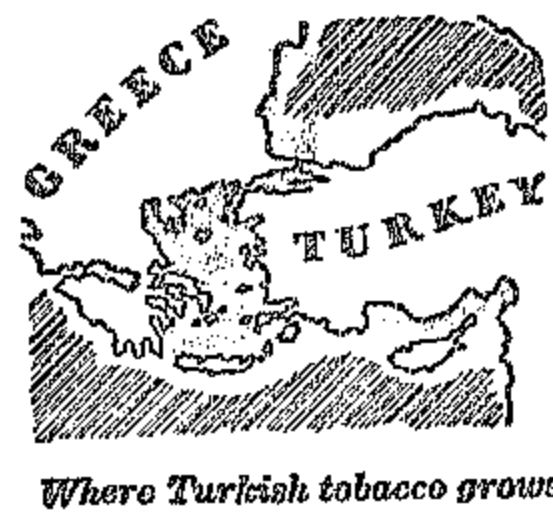
Where Turkish tobacco grows

Eastward ho! Four thousand miles nearer the rising sun—let's go! To the land of mosques and minarets—so different from our skyscrapers, stacks and steeples.