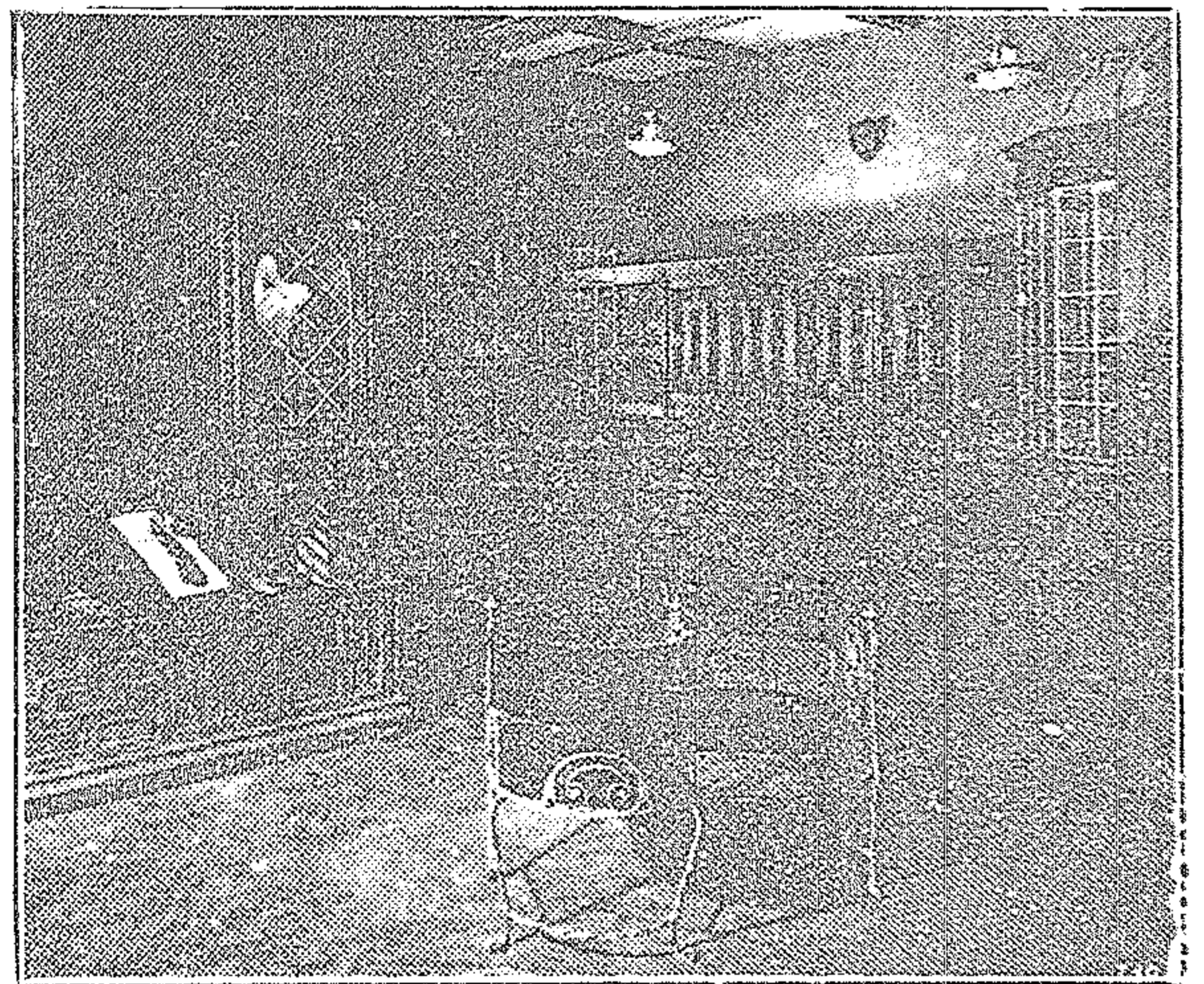
The South Room of the Beautiful, Enlarged Lytton College Shop on the Second Floor of our Main Chicago Store